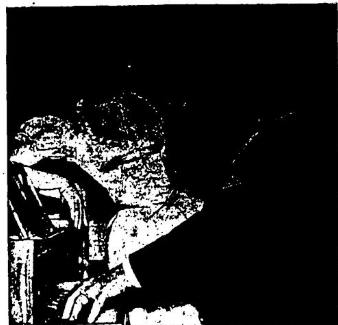
MUSIC HATH CHARMS. . . . No kidding, it's Wallace Beery harmonizing with June Powell in this scene from "A Date With Judy."