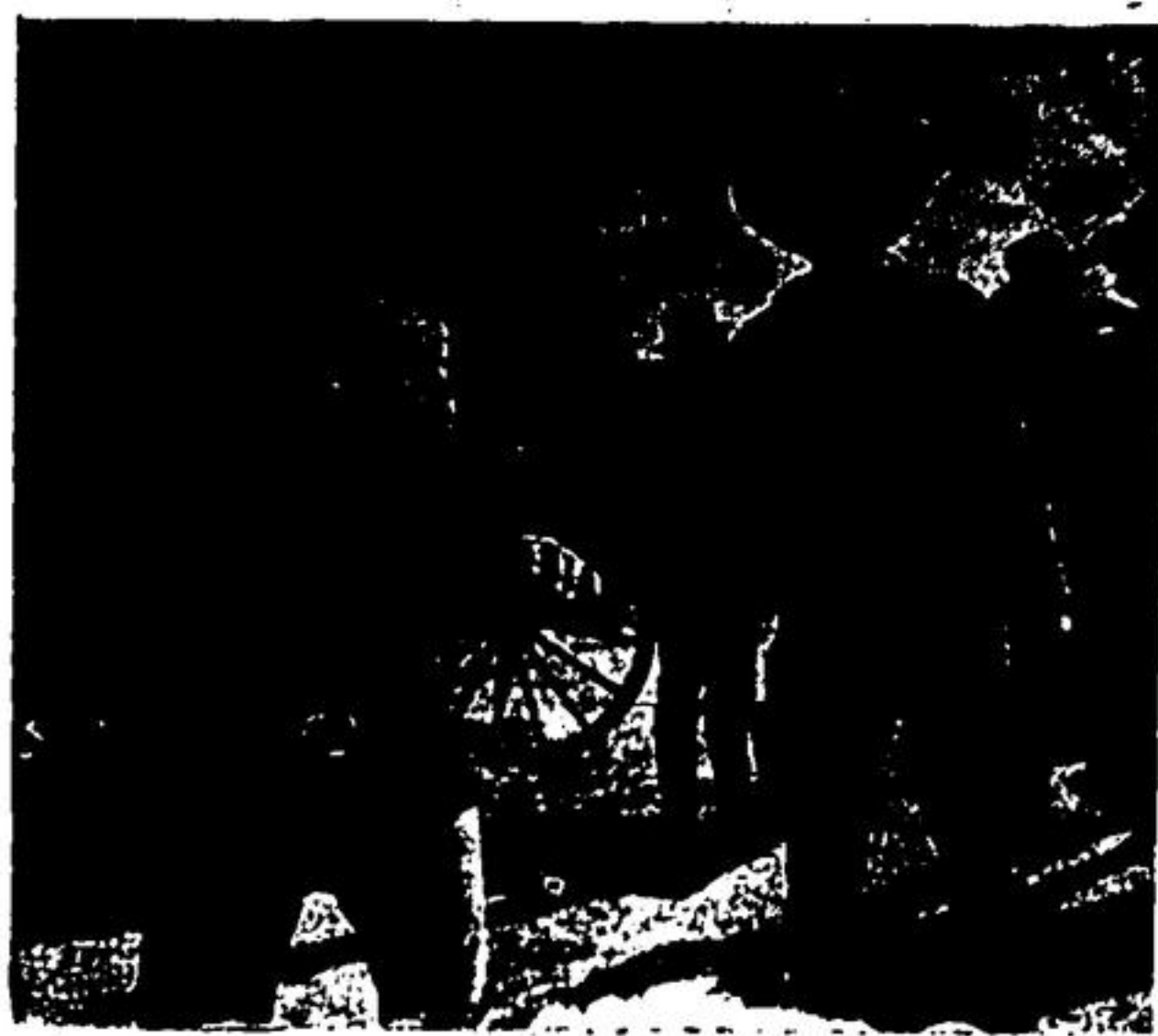
A tense moment from the Western saga "Red River", playing at the Roxy this week.