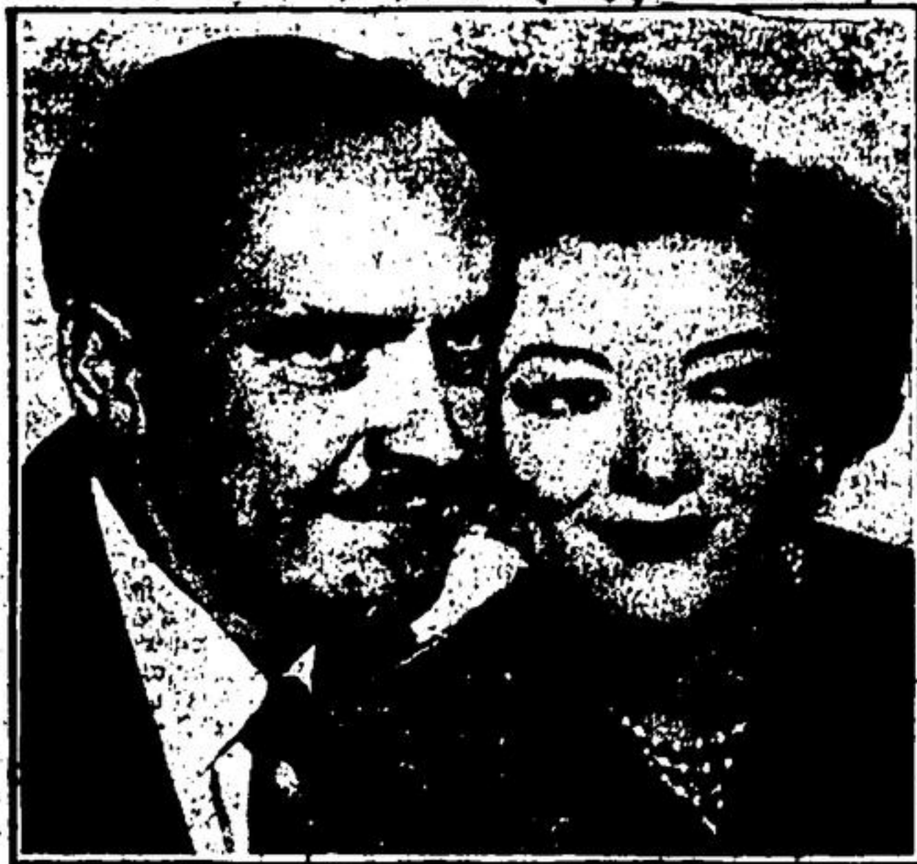
Fredric Maren and Myrna Loy, only two of the many stars in "The Best Years of Our Lives" which plays its last performance at the Roxy tomorrow.