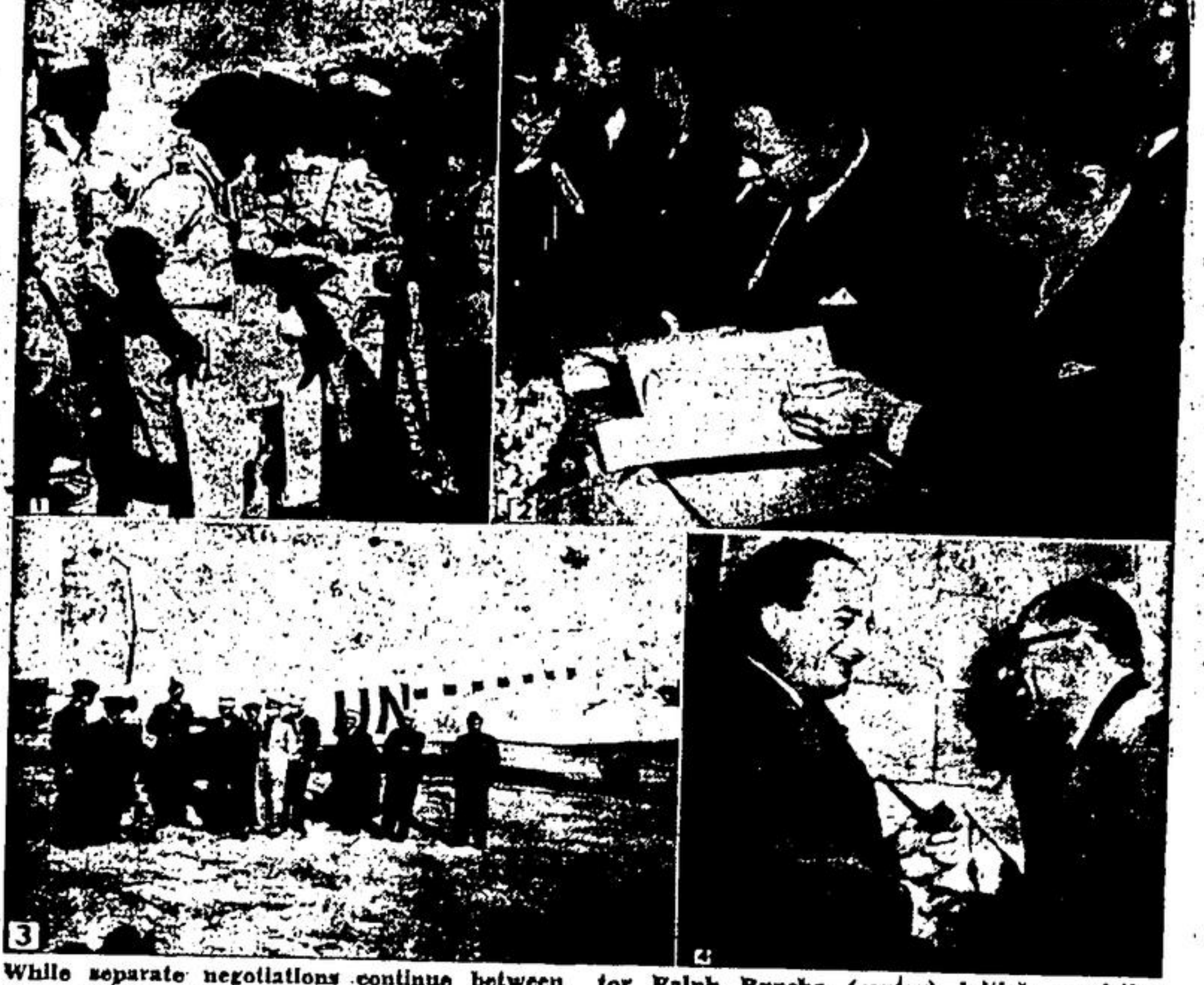
While separate negotiations continue between the new state of Israel and the Arab nations, truce teams (1) sent by the United Nations, check opposing Arab and Israeli positions during informal conferences somewhere along the front. Meantime, (2) at United Nations Headquarters on the Island of Rhodes Acting U.N. Mediator Ralph Bunche (center) initials armistice agreement between Israel and Egypt, as U.N. plane (3) stands by to take truce teams anywhere they might be needed. The Israeli and Egyptian chief representatives (4) join in a friendly handshake after signing an armistice to end fighting between the armies of their countries.

DEPENDABILITY ECONOMY ROOMY COMFORT SMOOTH RIDING -PLUS- STYLE AND BEAUTY THAT LOOK AHEAD