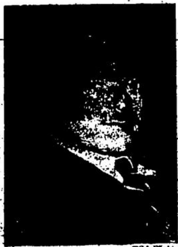
Famous jet engine engineer Sir Frank Whittle, M.B.E., C.B., arrived at Montreal Airport recently aboard a Trans-Canada Air Lines North Star Skyliner from London, Eng., on his way via TCA to Vancouver and Seattle, where he will read a paper on jet development at the 12th West Aviation Planning Comm. Sir Frank is the British inventor of the turbo jet aircraft engine.