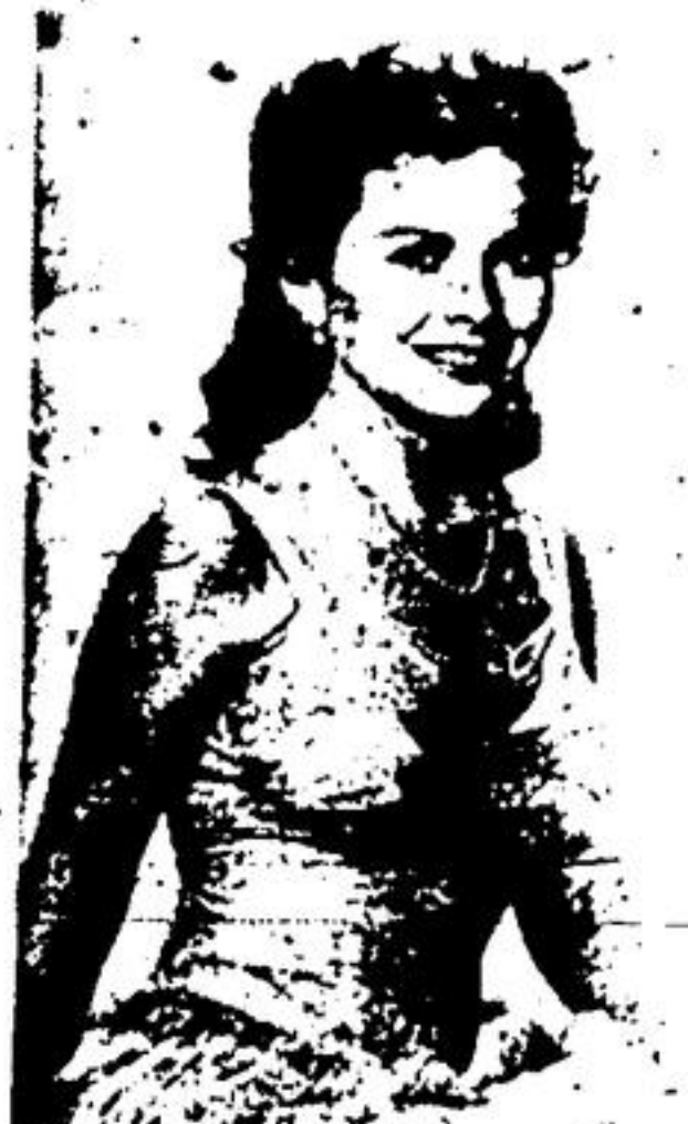
JEANNE CRAINE Featured with Dan Dailey in "You were Meant for Me" at the Roxy next week as Jeanne Craine who rose to stardom in "State Fair."