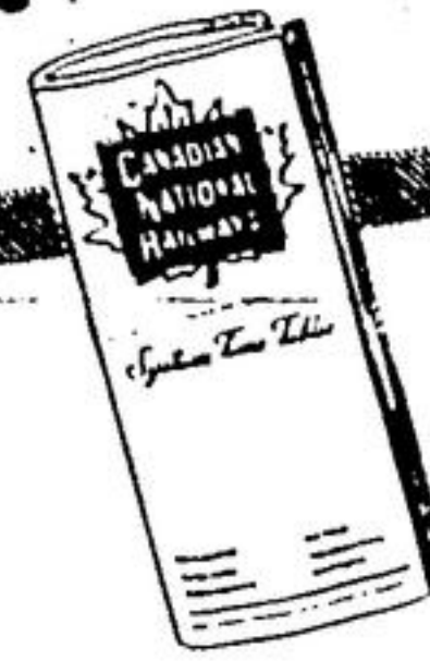
The "Blue Book" — your Canadian National Time Table — guide to every where in Canada.

The International Limited, Canada's premier International train, has for almost half