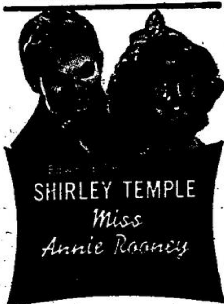
SHIRLEY TEMPLE Miss Annie Rooney

The Boys Are Wild About Shirley in Her First GLAMOUR Role!