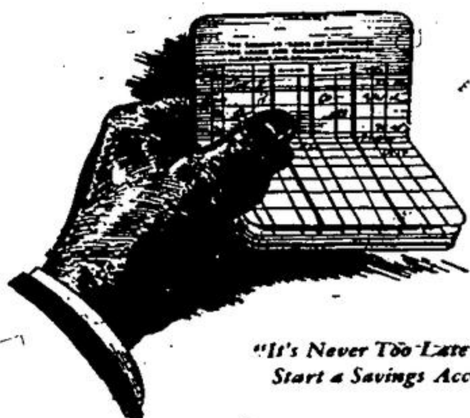
"It's Never Too Late to Start a Savings Account"

Save this money. Start a Savings Account with your nearest branch of The Canadian Bank of Commerce.