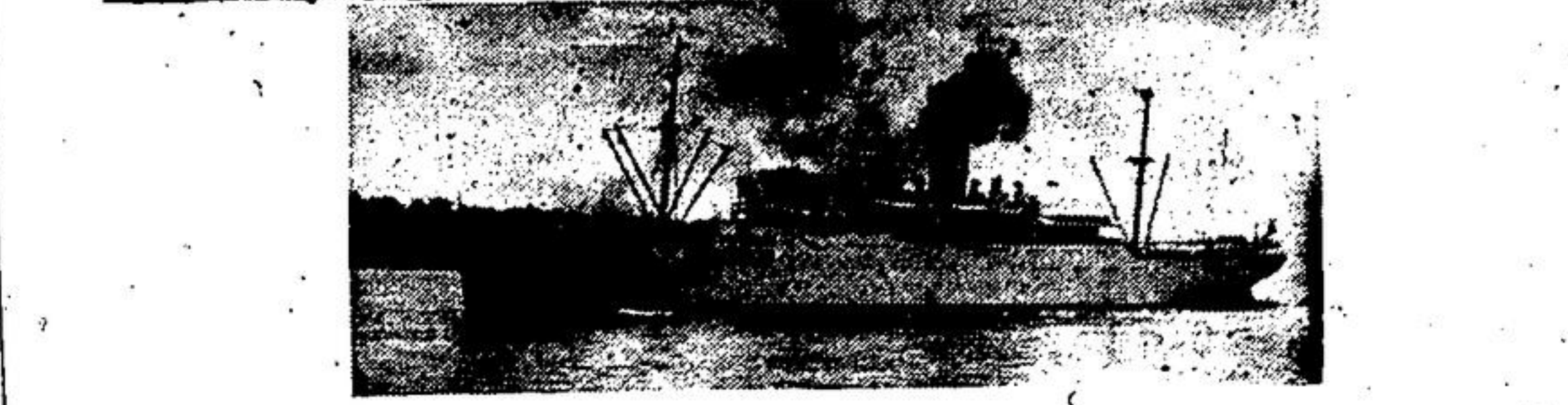
A veteran of nearly five years of war service, the Canadian National Steamship, Lady Rodney, has under- gone a complete rehabilitation and is back on "cruise street" as a first class luxury liner sailing on a regular schedule to Bermuda and the British West Indies from Halifax. Early last December, the Lady Rodney was berthed with the St. John Dry Dock Company where she was overhauled completely. The de-luxe cabins, top right, have been painted in pastel shades of blue and rose and refurnished with modern beds, dressing table and bathrooms. The garden lounge, top left, is refreshingly informal in light color scheme and rattan furniture. Below, the famous Lady Rodney, resplendent in a new white dress.