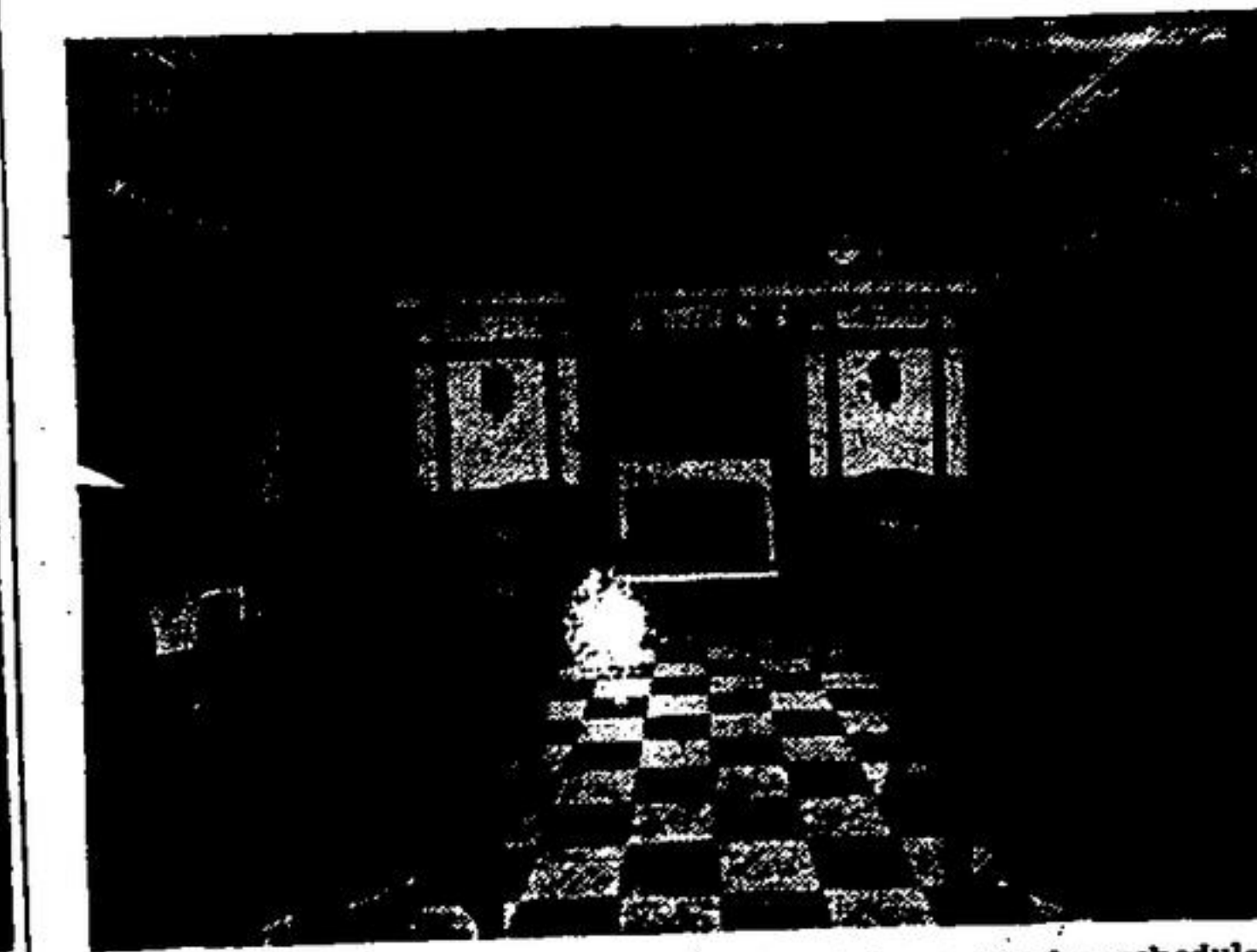
Rehabilitated after nearly five years of war ser- vice, the Canadian National Steamship, Lady Rodney, is once ag- ain plying a regular schedule to Ber- muda and the British West Indies from Halifax. Above is a view of the bolsterous staterooms of Canada's servicemen, the Canadian National Steamship, Lady Rodney, is once ag- ain plying a regular schedule to Ber- muda and the British West Indies from Halifax. Above is a view of the smoking room and bar completely re- decorated in the fashion of a club lounge.