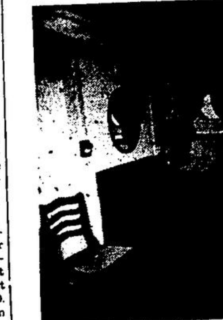
With nearly five years of war ser- vice behind her, the Canadian Na- tional Steamship, Lady Rodney, has returned to her peacetime calling as a luxury passenger liner. Shown above