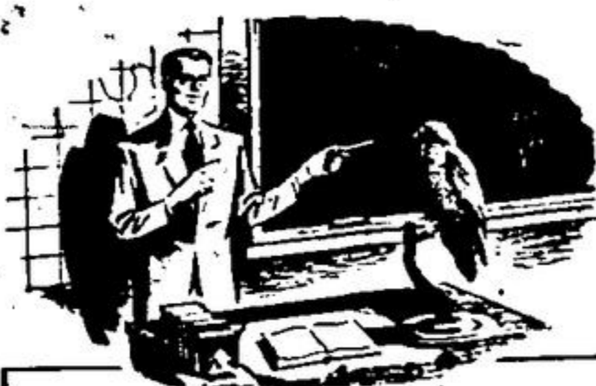
THE TEACHER —a Conservationist

THE CARLING BREWERIES LIMITED WATERLOO AND WALKERVILLE, ONTARIO