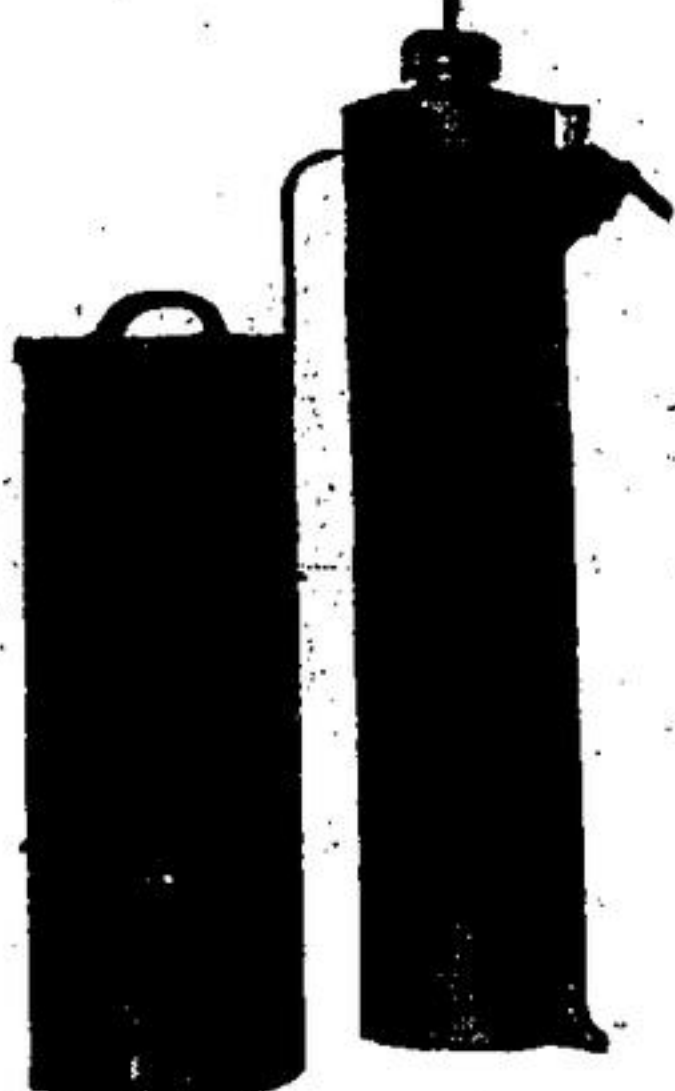
PRICED AS LOW AS $59.00 F.O.B. LONDON, CANADA

All the advantages and conveniences of DURO softened water are available to you again. Enjoy all the luxuries of softened water . . . all the savings made possible by a DURO installation. Dishwashing is more pleasant . . . laundering is easier and clothes are cleaner — softer — whiter. Dainty silks and lingerie retain freshness and beauty in DURO softened water.