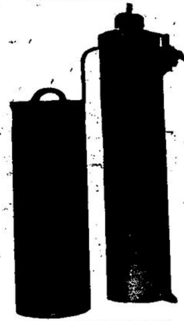
PRICED AS LOW AS $85.00 F.O.B. LONDON, CANADA

All the advantages and conveniences of DURO softened water are available to you again. Enjoy all the luxuries of softened water... all the savings made possible by a DURO installation. Dishwashing is more pleasant... laundering is easier and clothes are cleaner — softer — whiter. Dainty silks and lingerie retain freshness and beauty in DURO softened water.