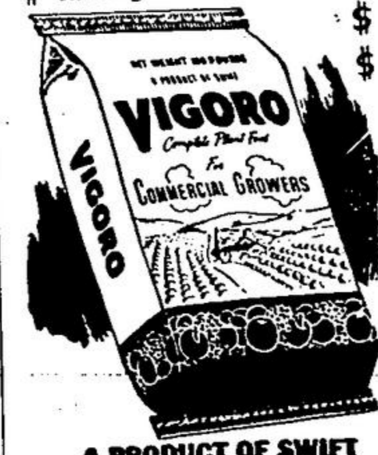
A PRODUCT OF SWIFT

Experience is proving that it pays the grower well to feed strawberries with Vigoro Commercial Grower. Increased yield, early maturity, full flavor, and excellent shipping quality are a few of the advantages many growers are attributing to Vigoro Commercial Grower. These are advantages that spell EXTRA profit. Investigate!