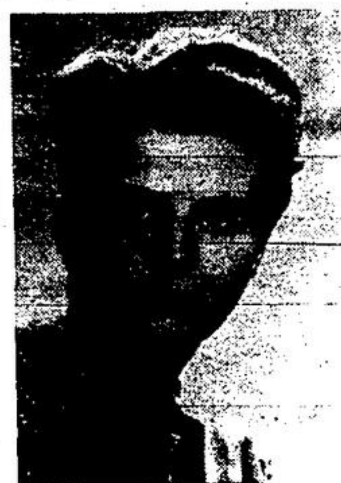
GIRL FROM TEXAS