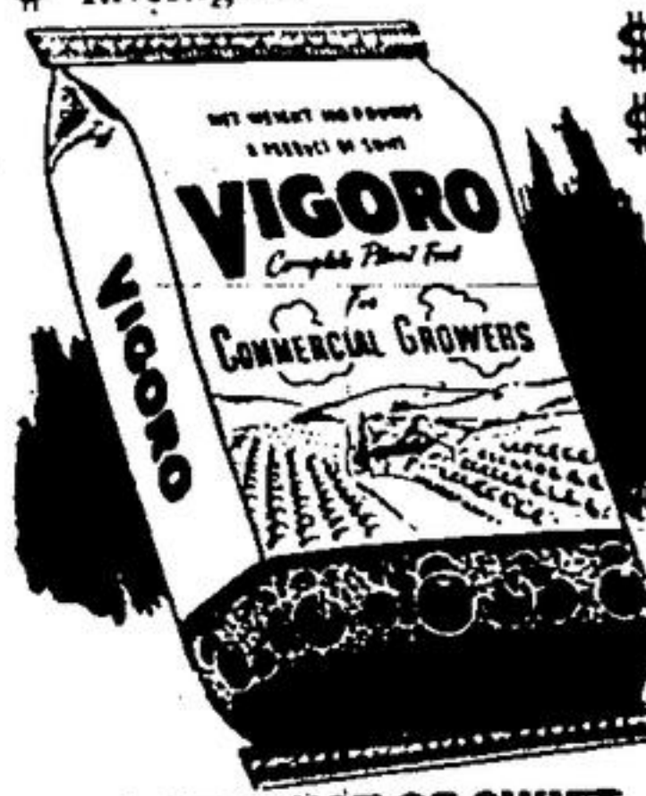
A PRODUCT OF SWIFT

• Experience is proving that it pays the grower well to feed strawberries with Vigoro Commercial Grower. Increased yield, early maturity, full flavor, and excellent shipping quality are a few of the advantages many growers are attributing to Vigoro Commercial Grower. These are advantages that spell EXTRA profit. Investigate!