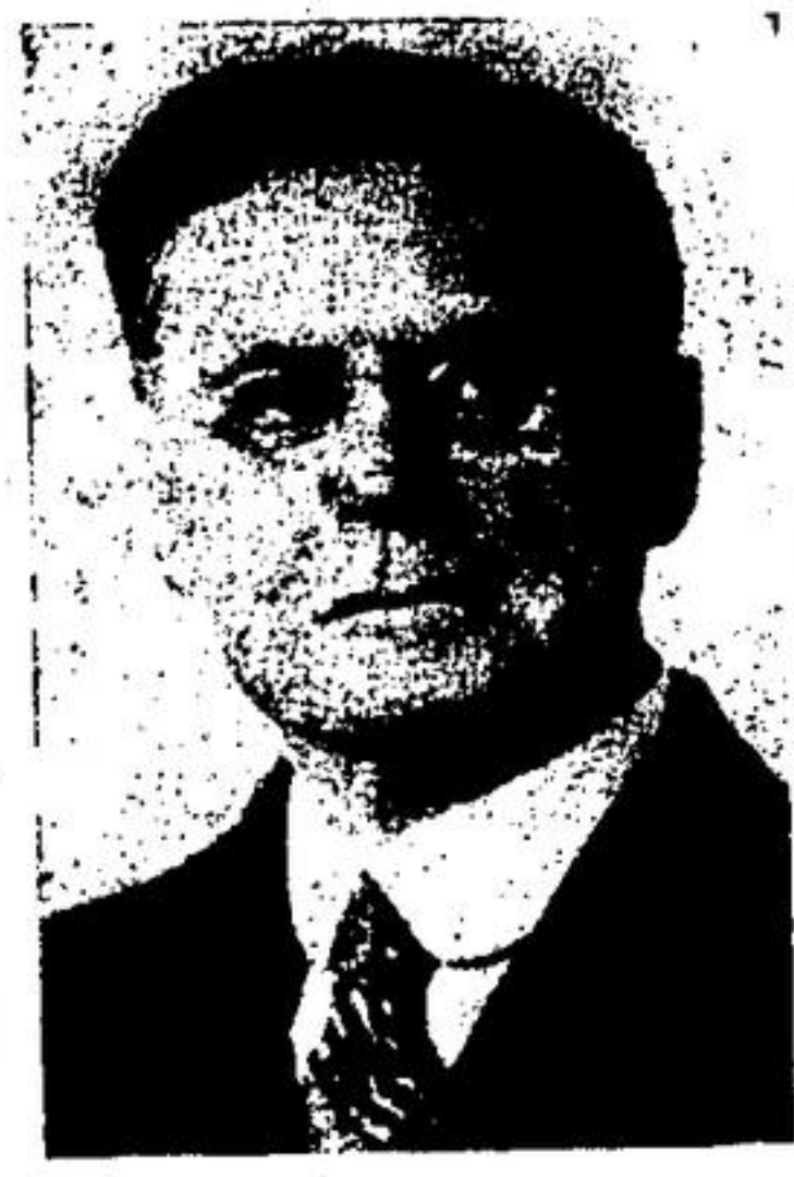
MOVES TO TORONTO