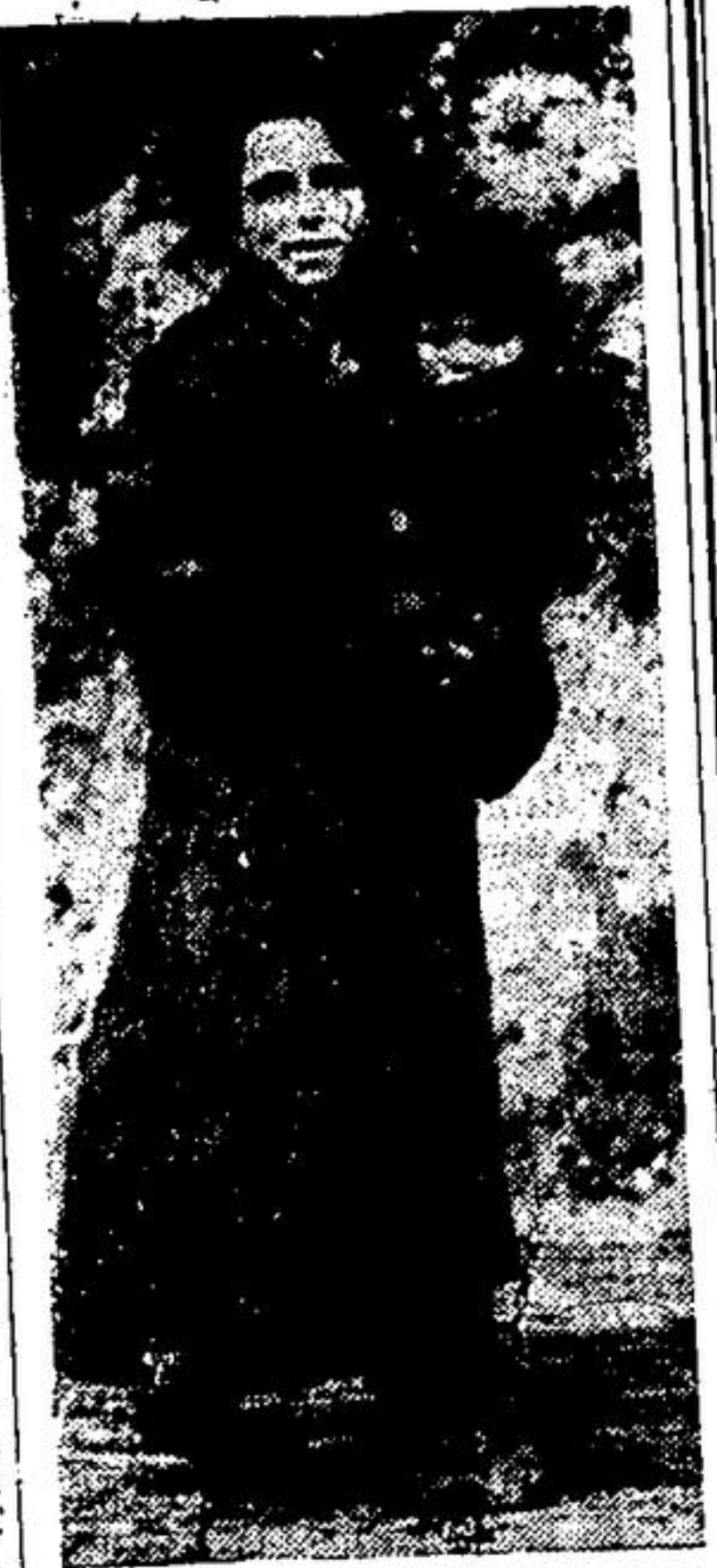
THIS WAR VICTIM MOTHER and baby believe "the only good Nazi is a dead Nazi". From such a dead Nazi, "Mom" obtained the overcoat which covers her and the baby. Millions of others in war-ravaged lands need all the serviceable used clothing you can give to the National Clothing Collection which will be carried on throughout Canada from October 1st to the 20th. The drive is sponsored by the Canadian United Allied Relief Fund and distribution to the liberated peoples of Europe will be under the direction of U.N.R.R.A.