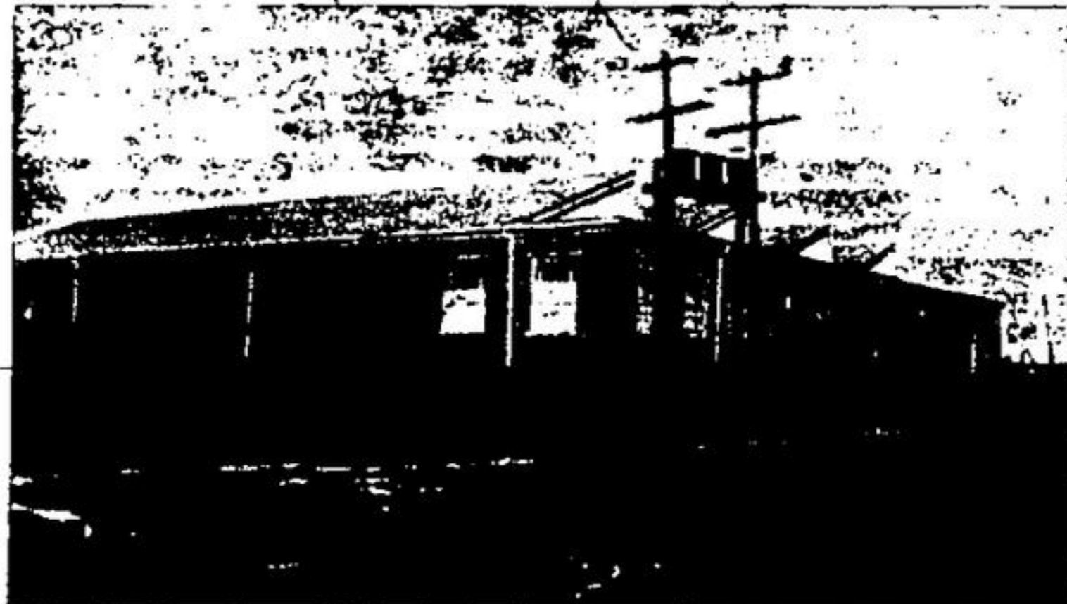
This reproduction of an old snapshot taken in 1940 is the best we could do to show what the plant was like in the early days.