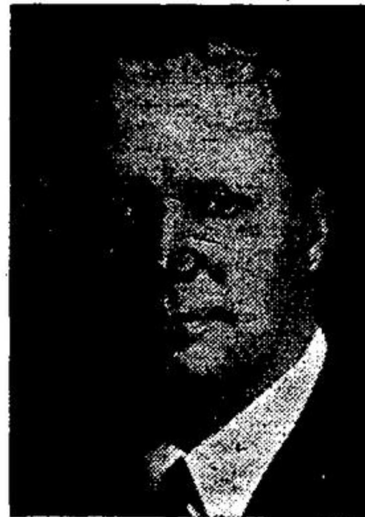
HON. GEORGE DREW, K.C.