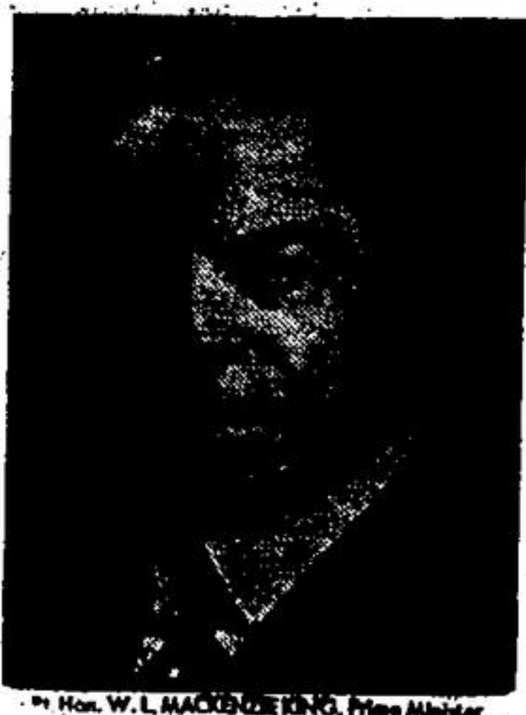
Mr. W.L. MACKENZIE KING, Prime Minister

You will have to decide whether you want the men who devised these measures to carry them through, or whether you wish to entrust your own and your family's future to others.