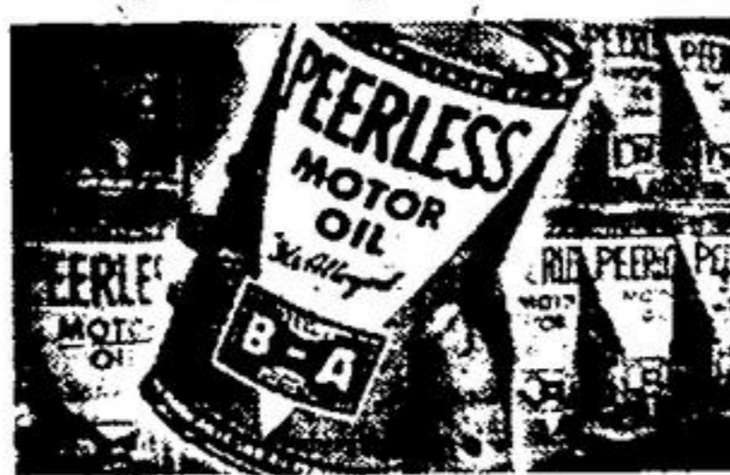
THE NOW TO replace old, worn-out winter grade oil with B-A Peerless Motor Oil. Delay may be disastrous! Drive in tomorrow to the sign of the big B-A!