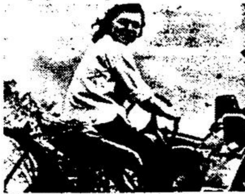
FARM TRACTORS need proper lubricating oil even more than cars and trucks. Because "it's alloyed" Peerless Motor Oil keeps tractor engines in better shape!

Here in a nutshell is the reason: From selected lubricating crude oils, B-A eliminates everything except the purest, "oiliest" lubricating fractions. Then, by a special process, Peerless Motor Oil is "alloyed" against decomposition under the heat and pressure it meets in the engine of your car! For longer, safer car life switch to B-A Peerless Motor Oil!