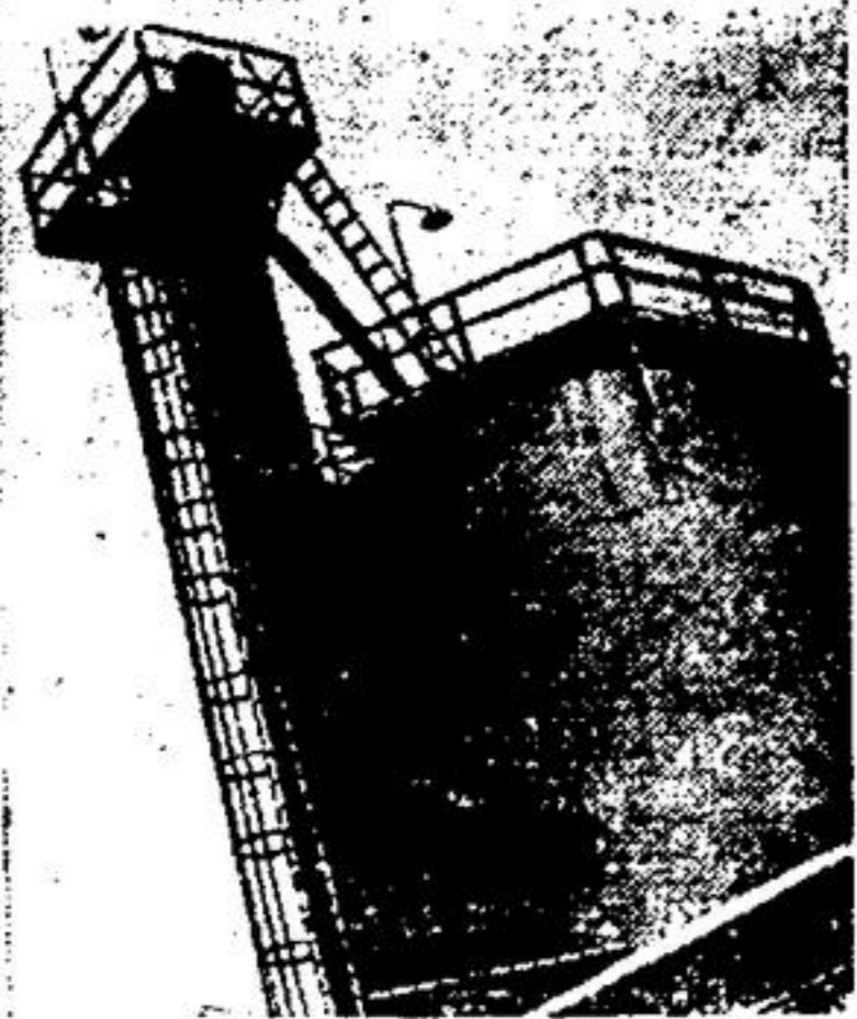
HIGH VACUUM Distillation... Catalytic Process... M.E.K. Solvent... Catalytic Clay (part of this plant is shown above) these are each important steps in the famous Clarkson 5-point-process which makes the purest, most efficient lubricating oil known. Then comes the unique 5th step—the step that "alloys" the oil against oxidation; just as iron is alloyed against rust to make stainless steel. This step means that Peerless Motor Oil will stay on the job longer, keep engines cleaner, cut the repair cost.