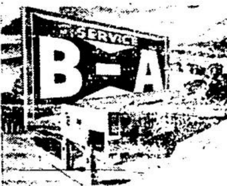
FOR BETTER SERVICE and better products—products like Peerless—change now to your British American Oil Dealer.

YOU ALWAYS BUY WITH CONFIDENCE AT THE SIGN OF THE BIG B-A