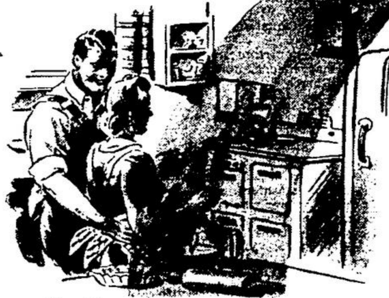
You will want cash if you plan to improve your home when the war ends...