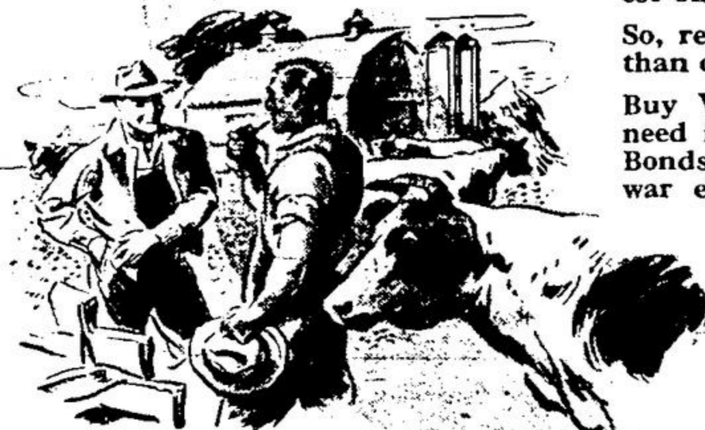
You will want cash if you plan to improve your live stock...

Managing a farm is in many ways similar to managing any other business. That is why reserve savings in liquid form are so helpful to a farmer.