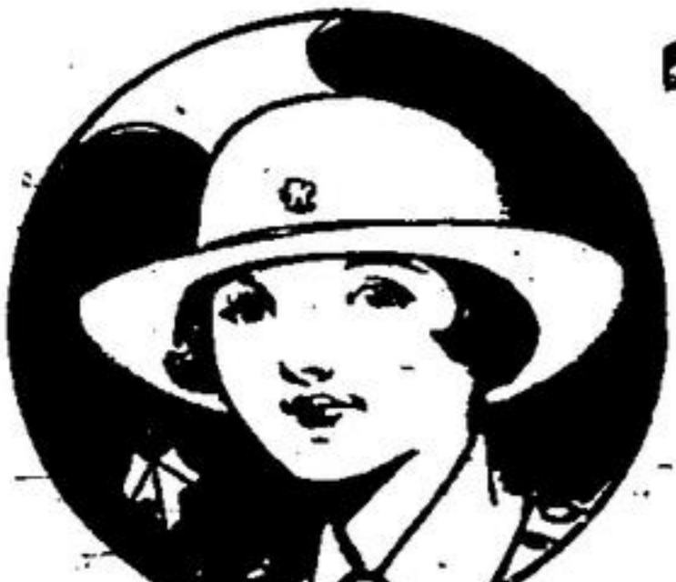
GIRL GUIDE NEWS

Let us show you the water softener that will save you money and keep you healthy.