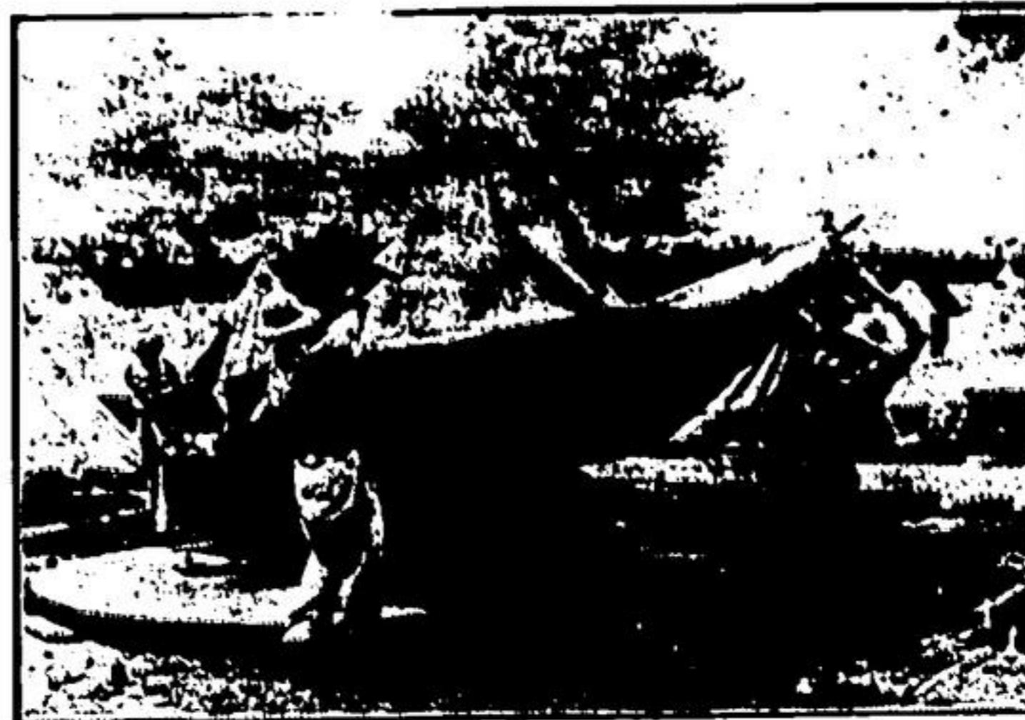
PITCHING TENT AT LORNE SCOTS RESERVE NUMBER CAMP

As part of their war effort, in April the students made a contribution of $10.00 to the Red Cross Drive. Student Council executive have decided to sponsor a tag day in the near future, on behalf of the Chinese War Relief Fund.