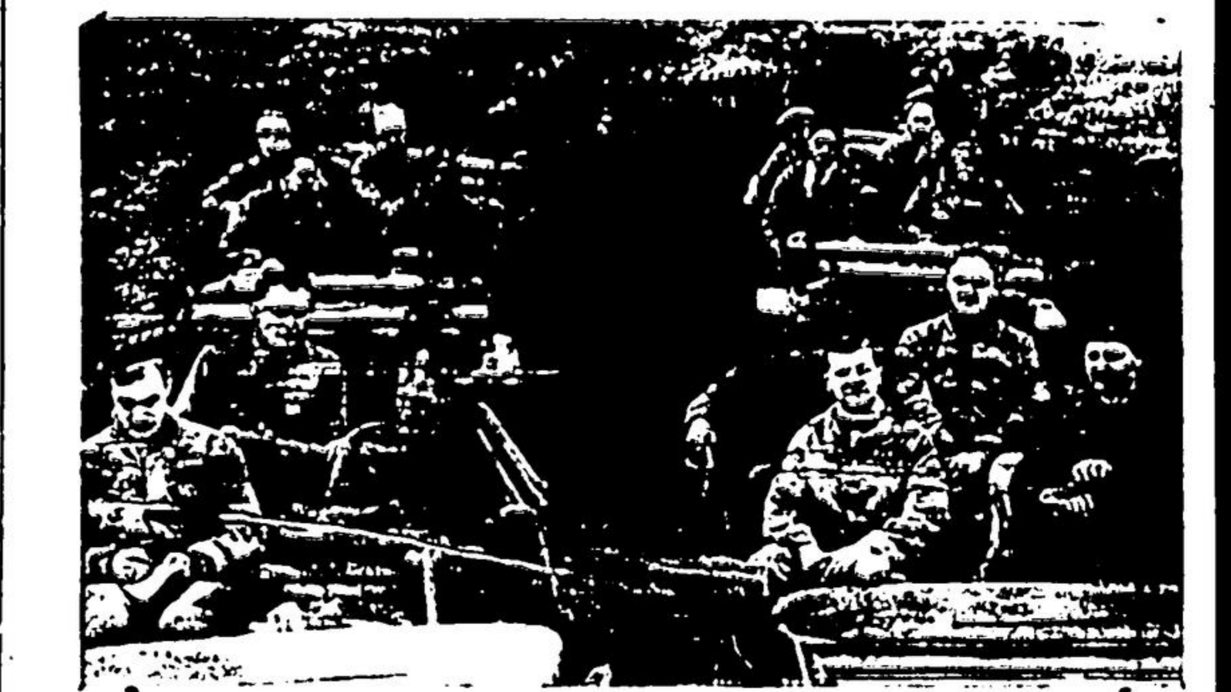
Visiting editors at a tank brigade demonstration rode about in these "tank buggies" and marvelled at the way they could negotiate any kind of rough terrain. These men were part of a party of Canadian editors who recently visited Great Britain at the invitation of the Canadian Government.