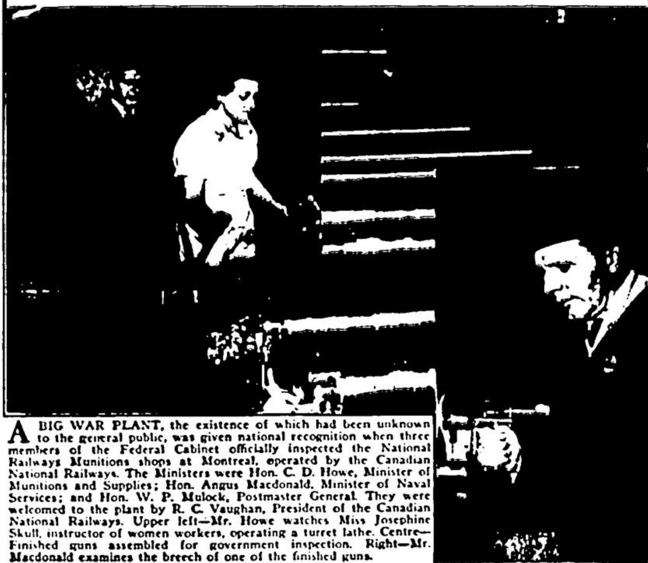
A BIG WAR PLANT, the existence of which had been unknown to the general public, was given national recognition when three members of the Federal Cabinet officially inspected the National Railways Munitions shops at Montreal, operated by the Canadian National Railways. The Ministers were Hon. C. D. Howe, Minister of Munitions and Supplies; Hon. Angus Macdonald, Minister of Naval Services; and Hon. W. P. Mulock, Postmaster General. They were welcomed to the plant by R. C. Vaughan, President of the Canadian National Railways. Upper left—Mr. Howe watches Miss Josephine Skull, instructor of women workers, operating a turret lathe. Centre—Finished guns assembled for government inspection. Right—Mr. Macdonald examines the breech of one of the finished guns.