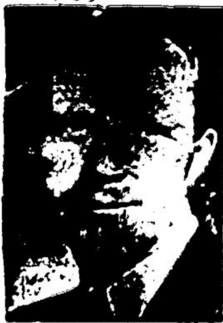
HON. ANGUS L. MACDONALD Minister of National Defense for Naval Affairs

FIRST OF A SERIES OF PICTURES SENT OUT BY THE DEPARTMENT OF INFORMATION AT OTTAWA