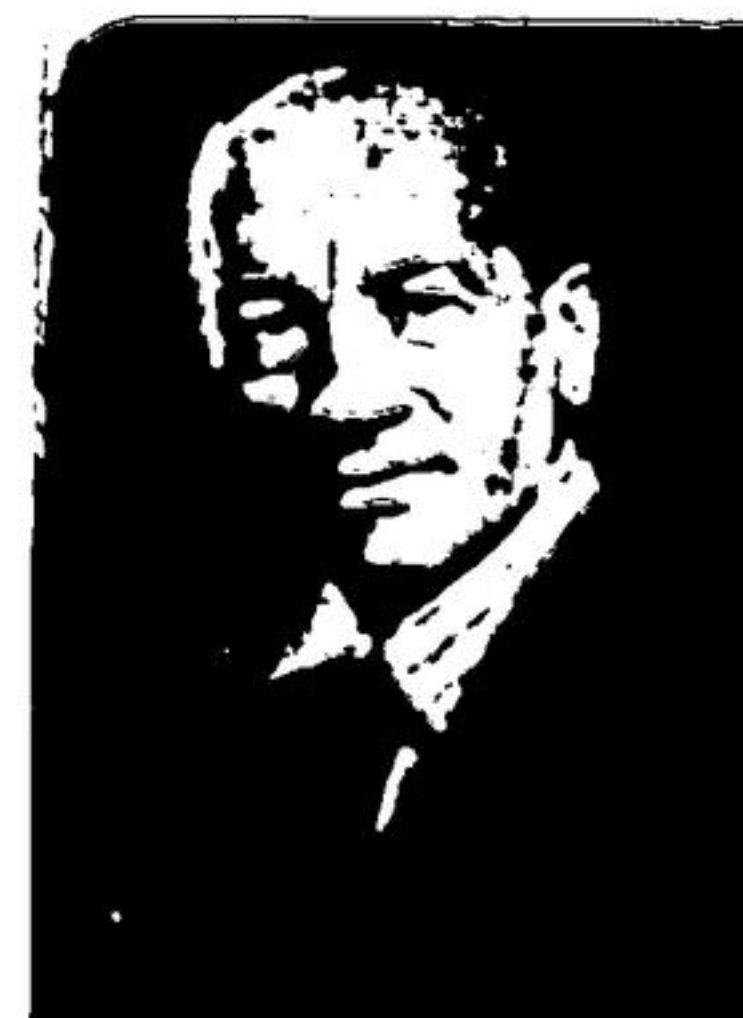
JOSEPH V. THORSEN Minister of National War Services