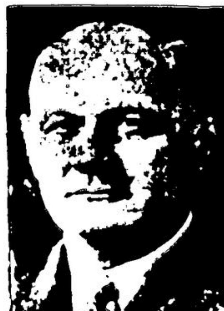
HON. HUMPHREY MITCHELL Minister of Labor