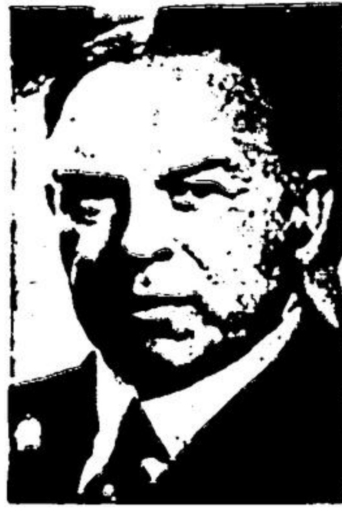
RT. HON. W. L. MACKENZIE KING Prime Minister of Canada