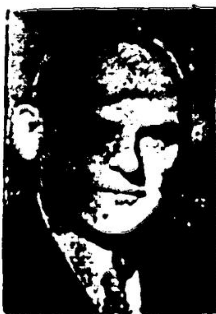
HON. C. D. HOWE Minister of Munitions and Supply