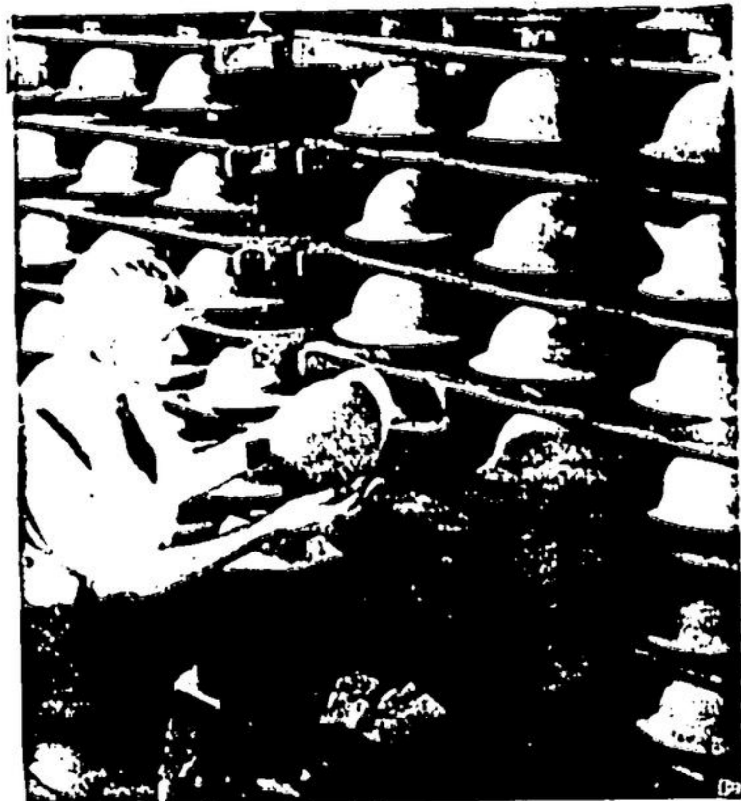
Although the soldiers refer to their head gear as "tin hats" these helmets are actually made of fine grade steel and are subjected to exacting tests. This batch is part of the production of a big Canadian plant which in peace time specializes in cooking utensils.