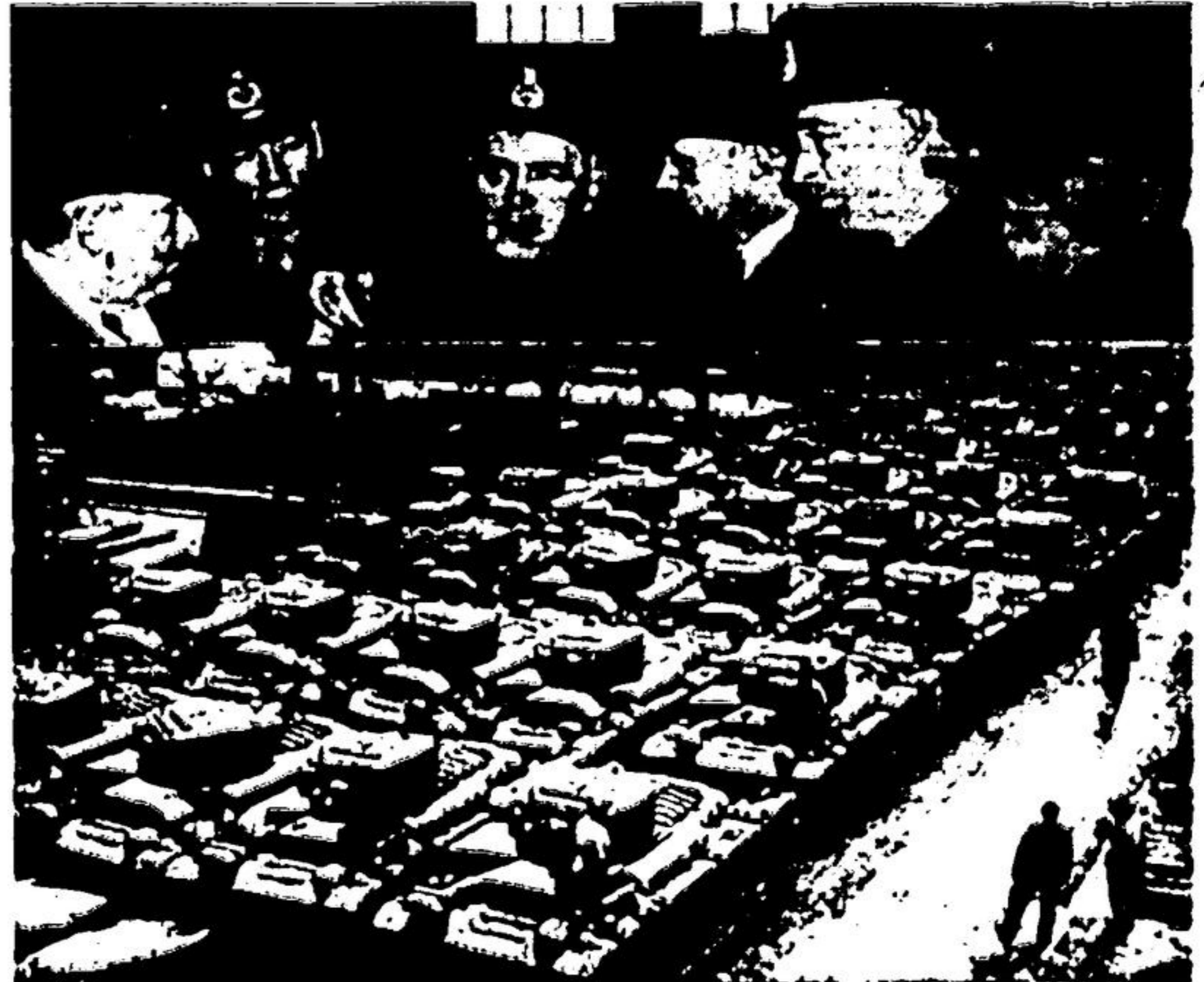
THE stepped-up tempo of tank production at Angus Shops, Montreal, was evident everywhere when Lieut.-Gen. A. G. L. McNaughton made a detailed inspection of the big Canadian Pacific plant, whose machinery is turning out increasing numbers of medium weight "Valentines" for the armed forces. Accompanied by ranking officials of the Canadian Army and senior officers of the Canadian Pacific Railway, Canada's No. 1 soldier received a first hand picture of tank construction from the smallest parts to the finished product. He displayed keen interest in the construction of the speedy war machines, a type that has been highly praised by the Russians on the field of battle. Highlight of General McNaughton's visit followed the shop inspection when six of the khaki-painted "Valentine" tanks, fresh from the Angus shops assembly line, raced out on the shops Midway, where they wheeled, plunged, and went through various other tactics to show their manoeuvrability.