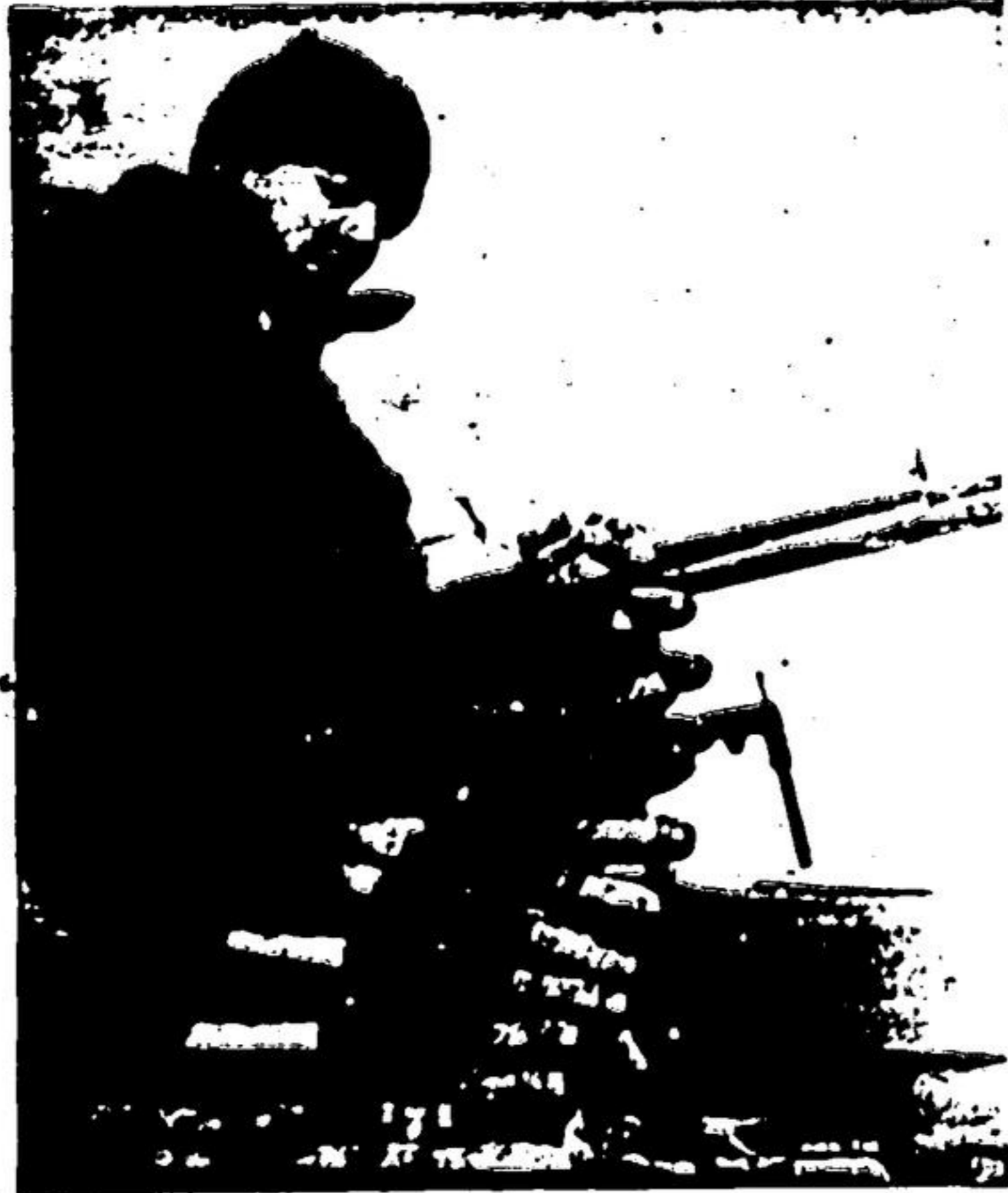
The approach of enemy U-boats to within a few miles of the Canadian coast has placed new responsibilities upon the hard-working Canadian Navy. A gunner on one of the R.C.N.'s patrol vessels is shown loading an anti-aircraft gun.