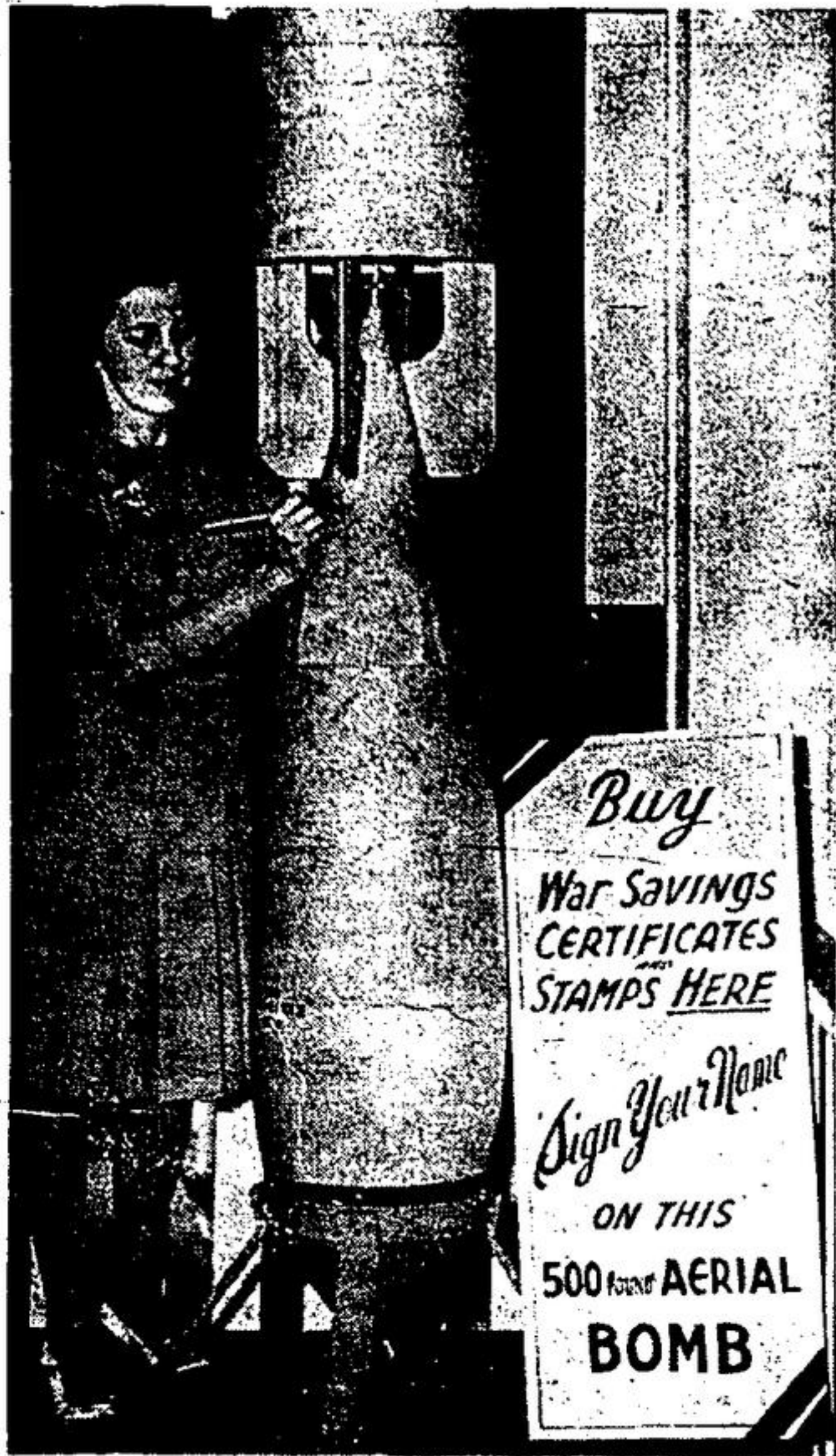
Picture shows a 500-lb. aerial bomb in the War Savings exhibit at the Canadian National Exhibition being autographed, carrying the names of thousands of Canadians and Americans who purchased War Savings Stamps or Certificates at the "Ex." The bomb will later be sent to carry out its "V for Victory" mission over Berlin, paid for by Canadian War Savings.