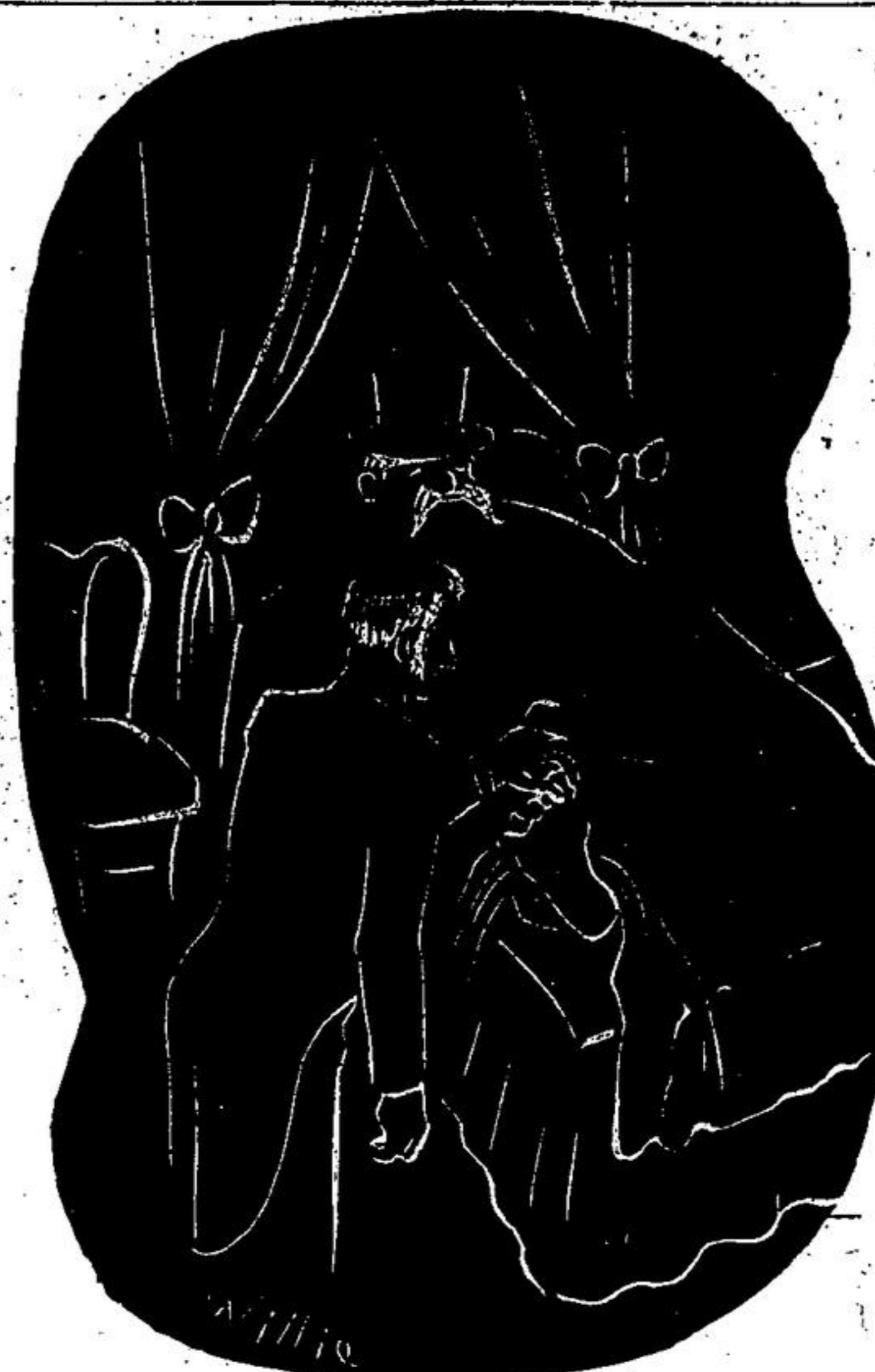
"This little piggy went to market."