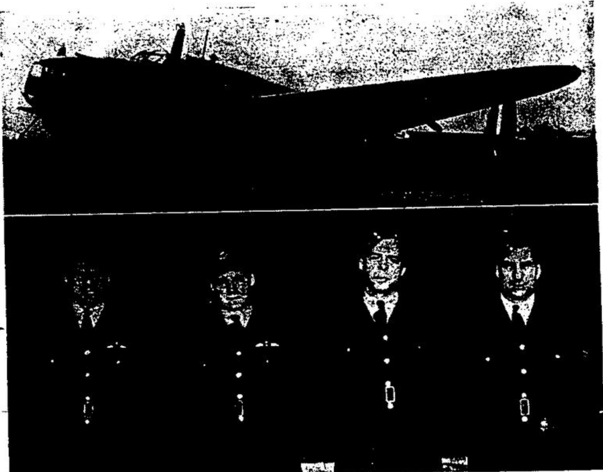
The above pictures show the Royal Canadian Air Force bomber and members of the crew which are carrying Canada's Victory Loan Torch across Canada. The plane left Victoria, B.C. on Empire Day following an impressive dedication ceremony. On its way