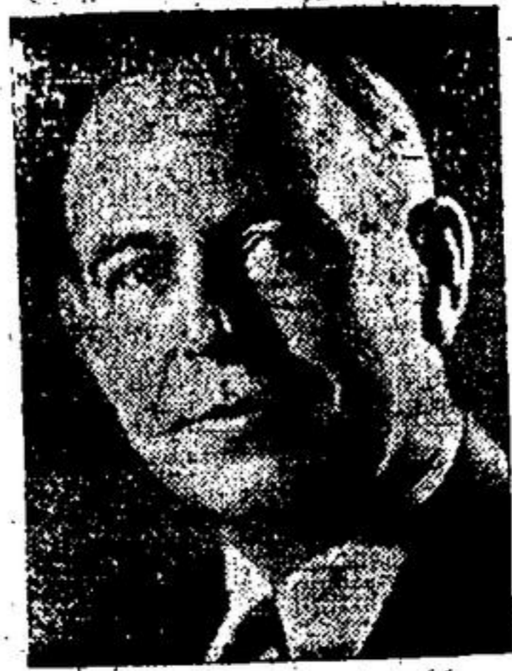
GEORGE C. ATKINS Candidate in Halton for the National Government Party.