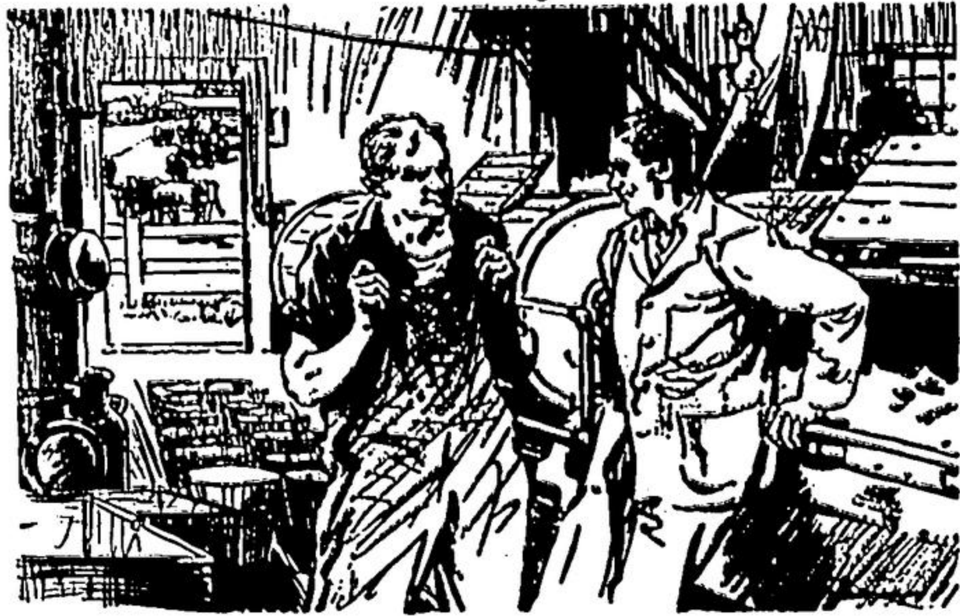
CANADIANS AND THEIR INDUSTRIES—AND THEIR BANK • DAIRYING •

HENRY: "Angus, do you ever think of the time we started this dairy business?"