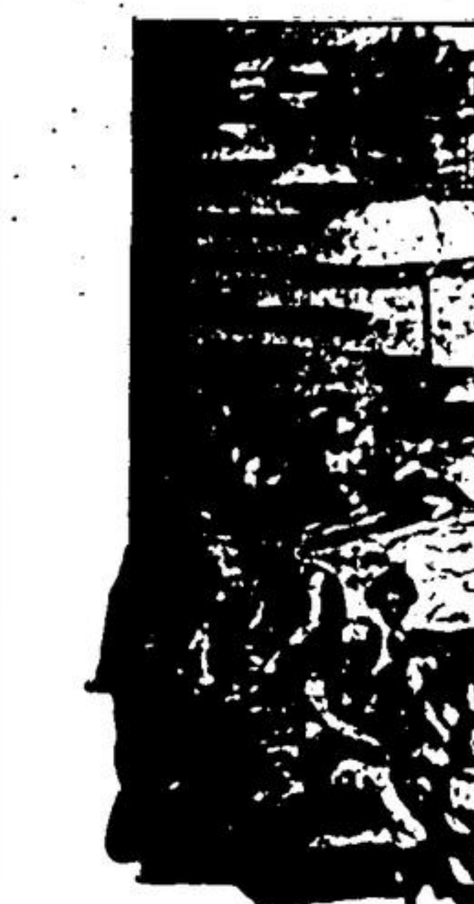
See bathing in the warm waters of Katy's Cove, St. Andrews-by-the-Sea, New Brunswick, and sun bathing on the shining sands...