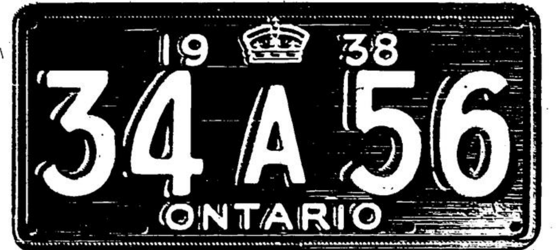
The design of the 1938 registration plates is exceptionally attractive with Crown and Orange figures on Blue background.