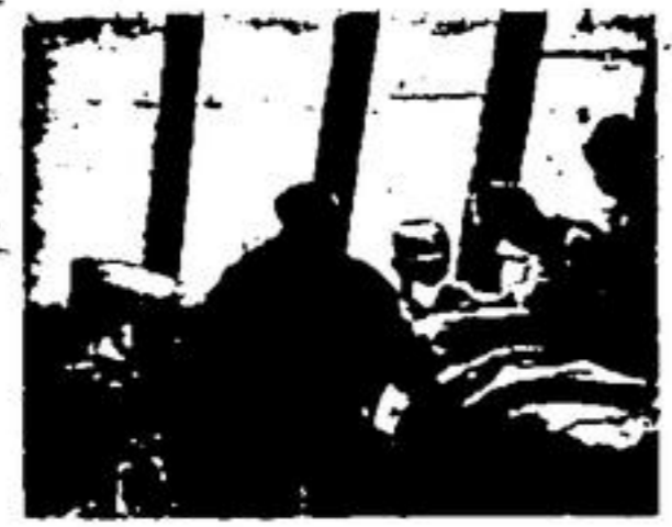
Every hospital in the world has its share of needy children. Some are born with deformities, some are born with diseases, some are born with disabilities. All need the help of a hospital.

Needy children from all over the Province are treated regardless of race, creed or financial circumstance. This policy has been continued for over 60 years in the firm belief that everyone who understands the facts would want this great work to continue . . . would agree that no Ontario child should be denied a chance for health or escape from deformity if mere money makes the difference. Over 95% of our beds are in Public Wards. The Hospital receives no support from the Toronto Federation for Community Service because patients are accepted from all parts of the Province. We must therefore appeal to a humane and generous public to take care of an annual deficit . . . this year it is $68,000.00. Please mail a donation to the Appeal Secretary, 67 College Street, Toronto. The thanks of little children will be your reward.