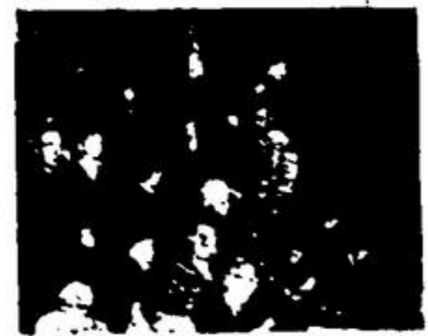
These little children are the ones who need the help of a hospital. They are the ones who are born with deformities, diseases, and disabilities. All need the help of a hospital.