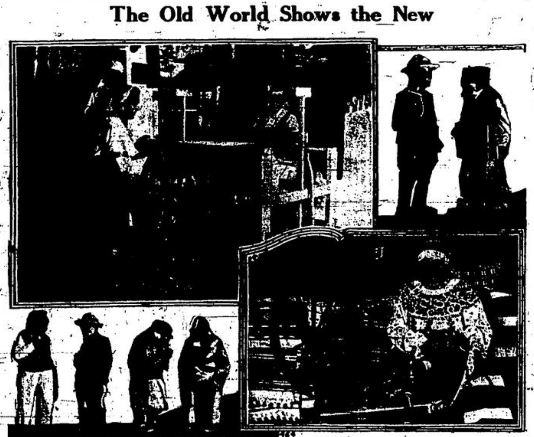
When the third of the Great West Festivals opens at the Palliser Hotel, Calgary, March 19-22 next, a score of nations will contribute to the success of the affair in folk songs, folk dances and handicraft work of which a special exhibition will be held by the Alberta Branch of the Canadian Handicraft Guild.

A fisherman, returning home from an unsuccessful fishing trip (as far as fish was concerned) stops at a fish store and purchases a fish. As the clerk was about to hand them to him he stepped back from the counter, and requested the clerk to throw them at him.