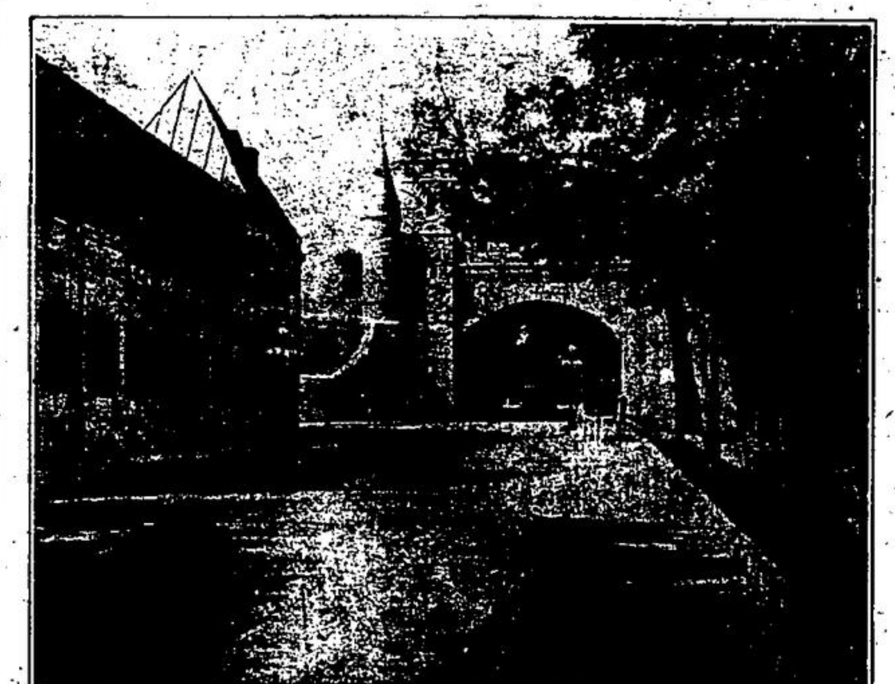
Where the C.W.N.A. Delegates met.—The famous Louis Galt, Quebec.