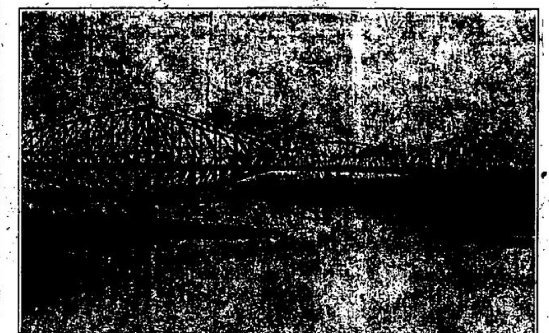
ENGINEERING WONDER OF CANADA.—The Quebec Bridge, over which Canadian National trains bore many of the C.W.N.A. delegates.

The accompanying photographs are only a few of the many places of interest visited by the members of the Canadian Weekly Newspapers Association while attending their Annual Convention which was held in Quebec City