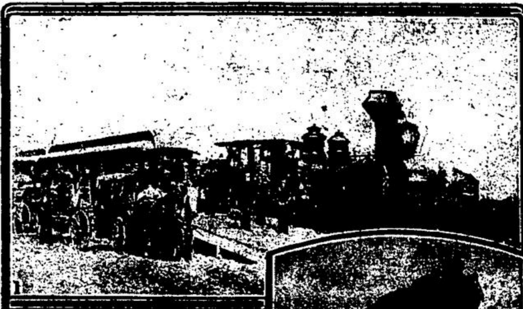
The first Trans-Canada train in 1886. The Trans-Canada of 1926.

The fortieth anniversary of the first Trans-Canada train has recently been celebrated by the Canadian Pacific Railway. It was the 28th of June 1886 when the train pulled out of Dalhousie Square Station, Montreal, on its long pilgrimage of 2,290 miles across the Dominion.