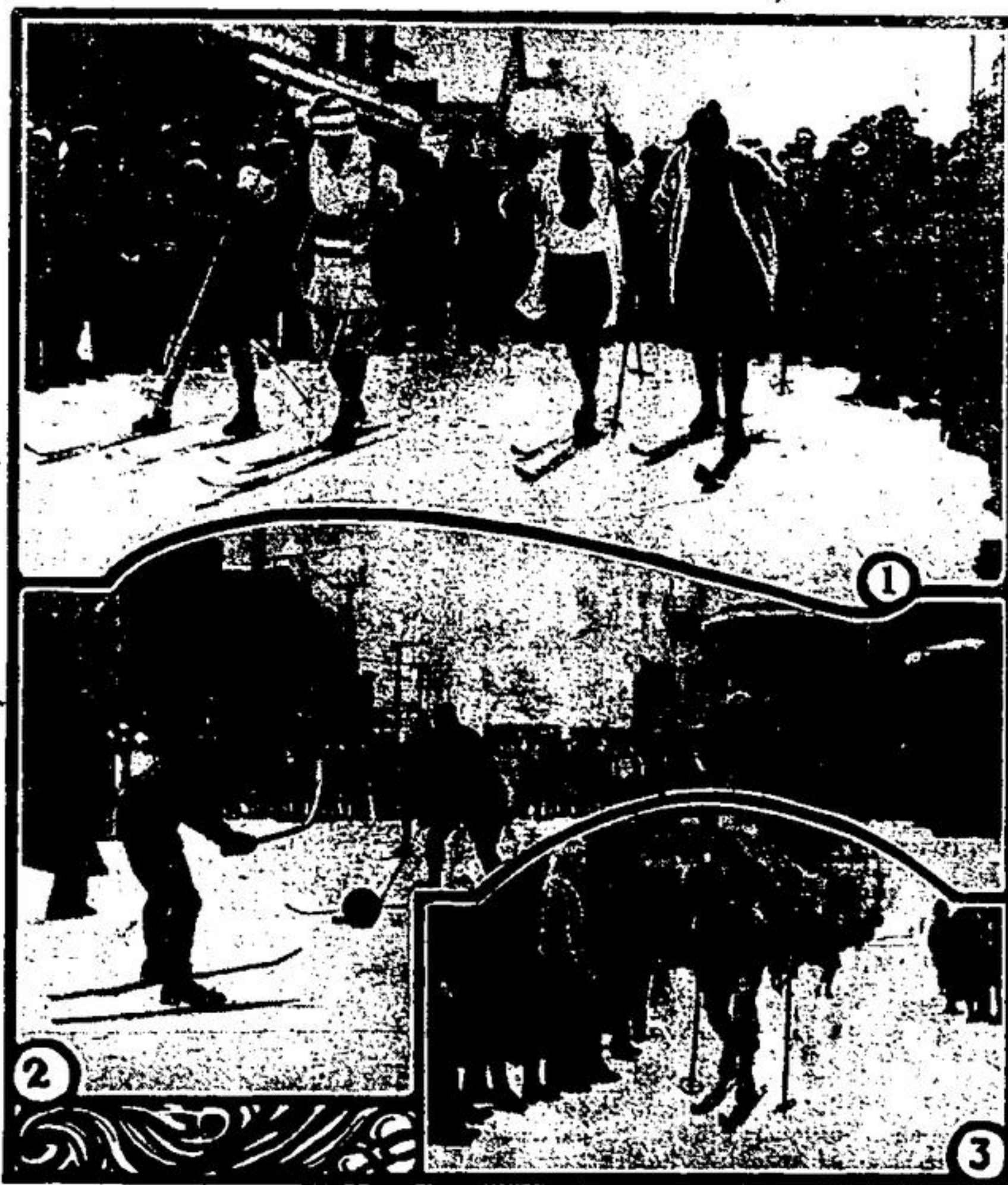
1. Start of Ladies Ski Race during the Revelstoke Carnival. 2. A new diversion—Sledging on hills with a foot-hill. 3. Ernest Field