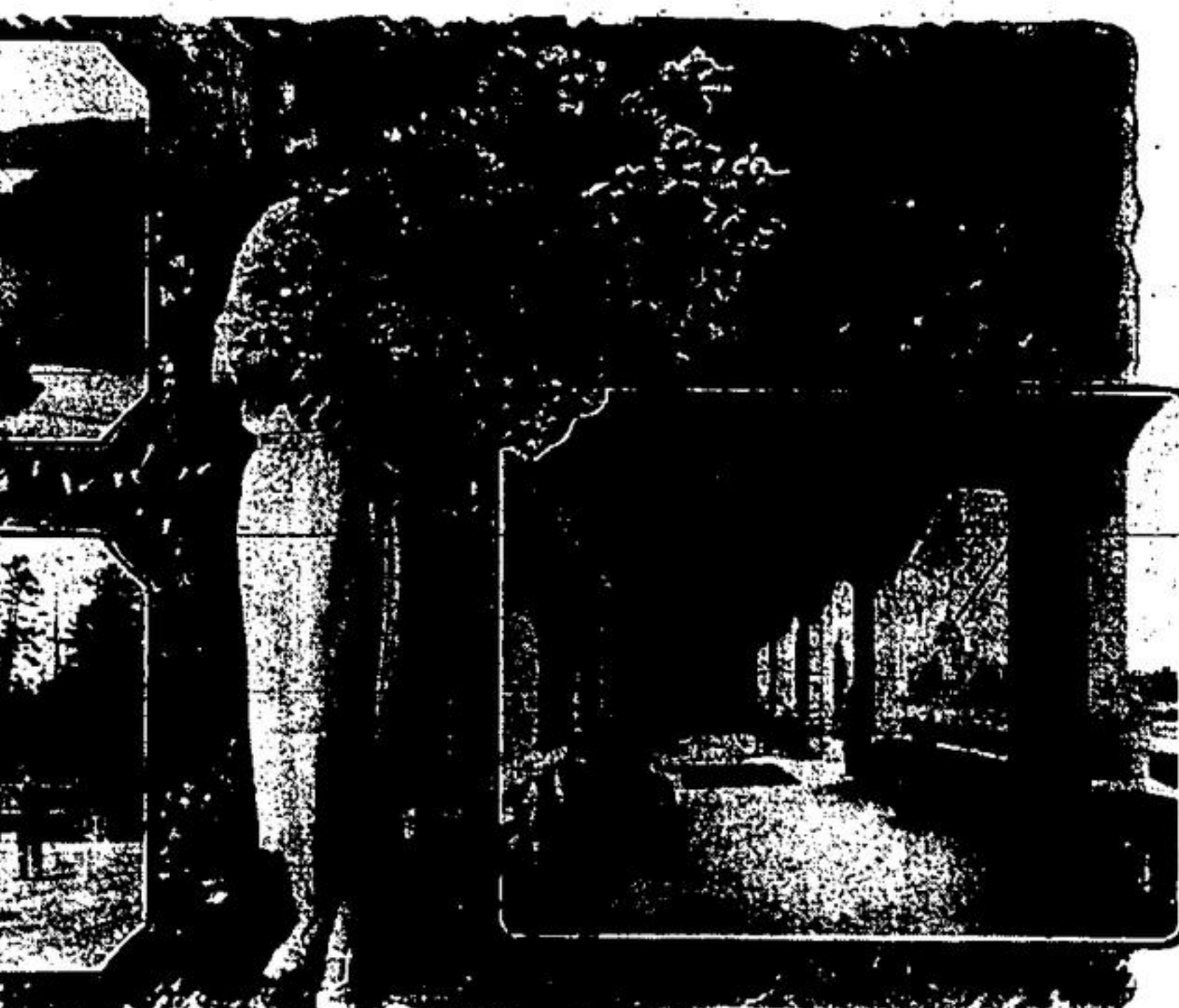
In the Empire Hotel Gardens. At the top, inset, a view of the Malahat drive, Briton, one of the many public golf courses for which Victoria is famous and at the right a photograph taken from the verandah of the Empire Hotel with a glimpse of the Parliament Buildings through the shrubs.

Famed for a mild, equable climate, a scenic setting equalled to the choicest English beauty spots, a resemblance which has led to the appellation of "A Little Bit of Old England" and the up-to-dateness of a modern city has combined to make Victoria the "Evergreen City," one of the principal tourist cities of the North Pacific coast throughout the entire year.