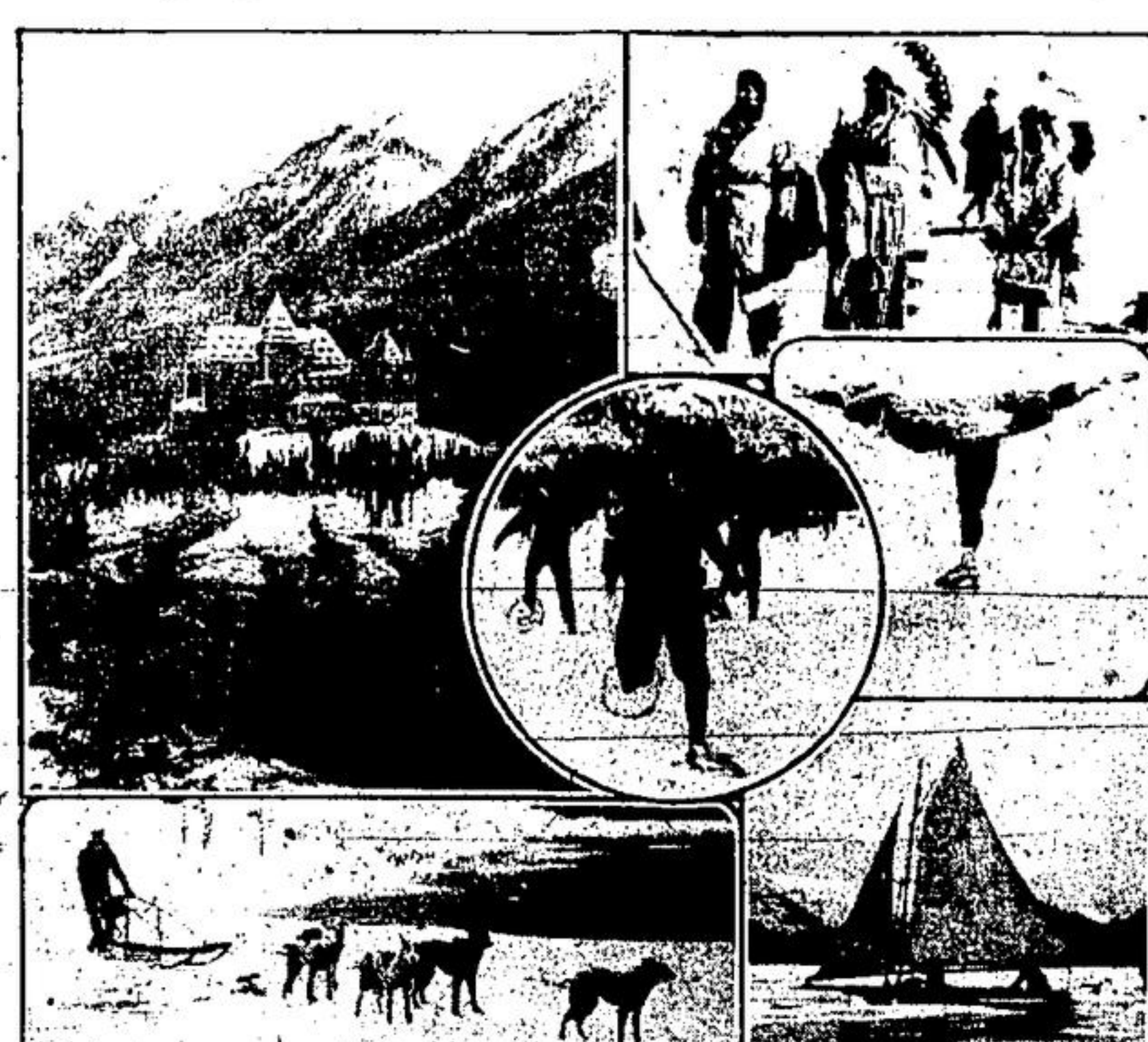
Top left, Banff Springs Hotel in winter garb; below, a dog sled team. Stony Indians attend the Carnival in full force and regalia, and figure skating, snowshoeing and ice fishing are but a few of the many seasonal attractions to the famous mountain resort.

Banff, immediately one conjures up visions of the Bow River, sunny alpine, warm days, summer dresses, and excursions into the snow capped mountains, swimming in the pools, hiking boots, breaks and bathing suits.