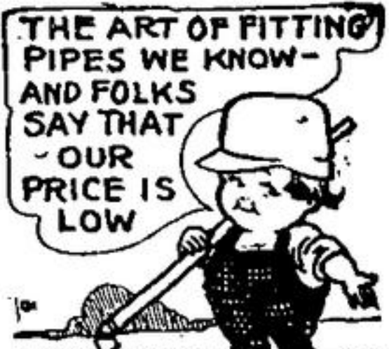
Kennedy's Little Plumber

THE ART OF FITTING PIPES WE KNOW AND FOLKS SAY THAT OUR PRICE IS LOW