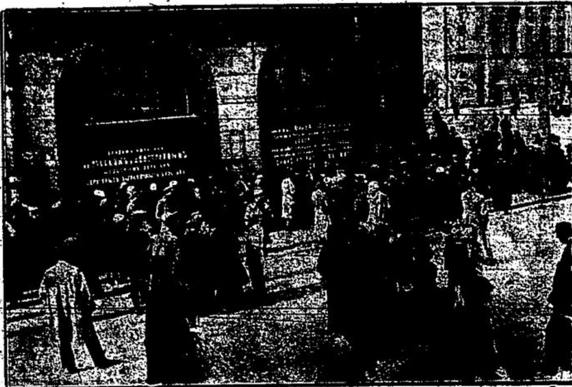
Corner of one of the Moscow railway stations waiting for the ticket office to open so that they may obtain Government tickets, which will permit them to leave the city. Note the Canadian Pacific Railway sign in the window.