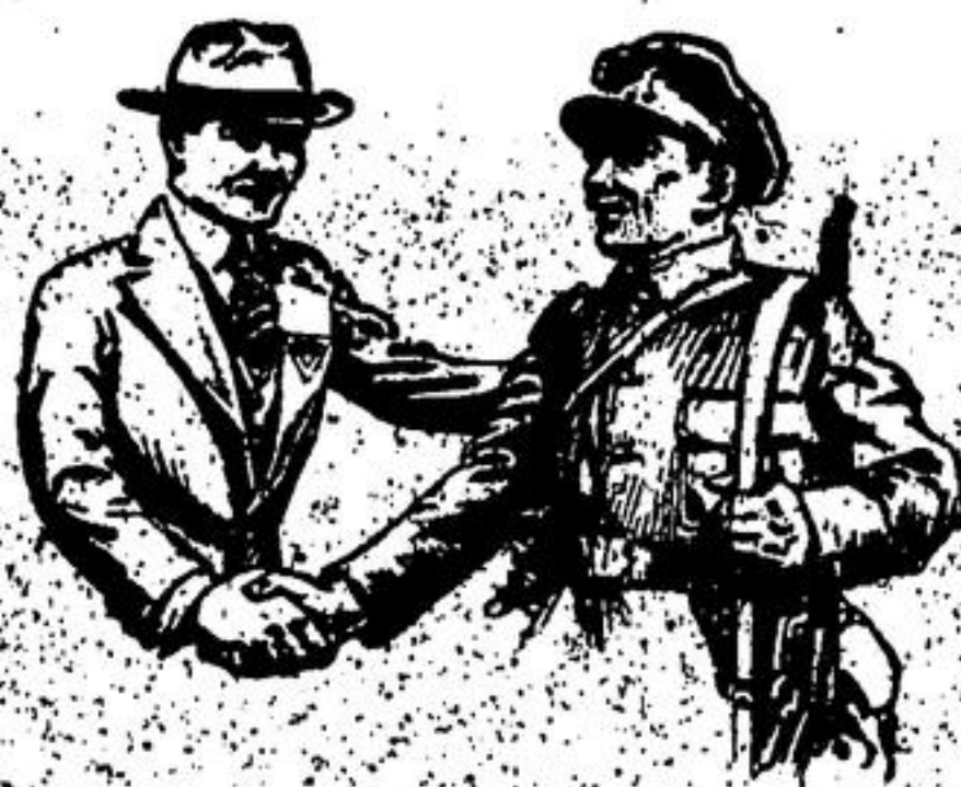
The Y.M.C.A. will keep its chain of Service unbroken till the end.

For Canada's Manhood The Reconstruction program of the Y.M.C.A. includes the following vitally important developments: