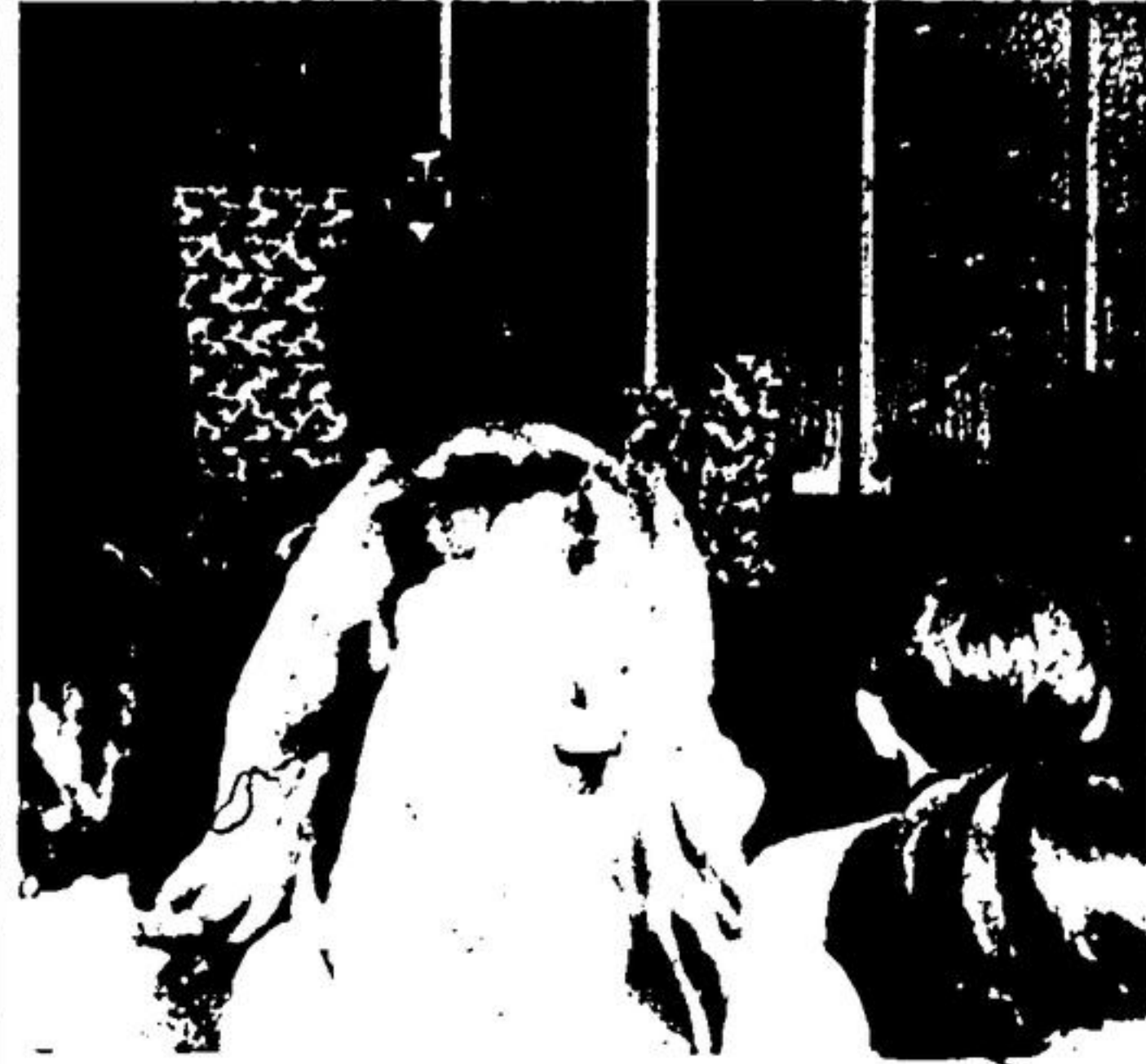
YOUNG VENTRIQUIST delighted young audience at the Micro party.