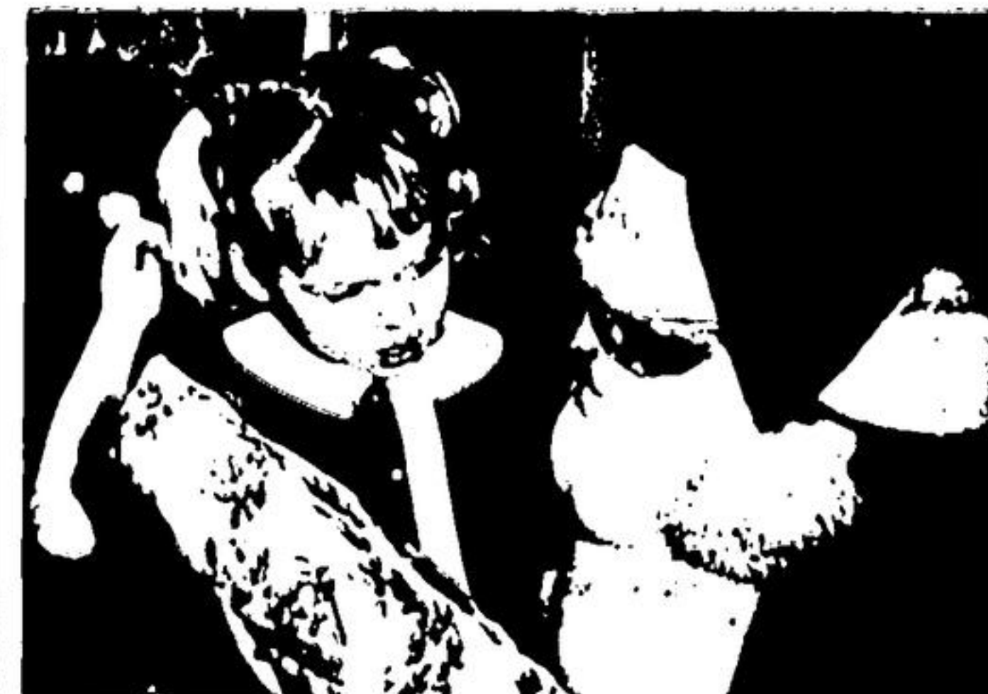
WELL, I HAD THIS long list but I kind of forget, now....