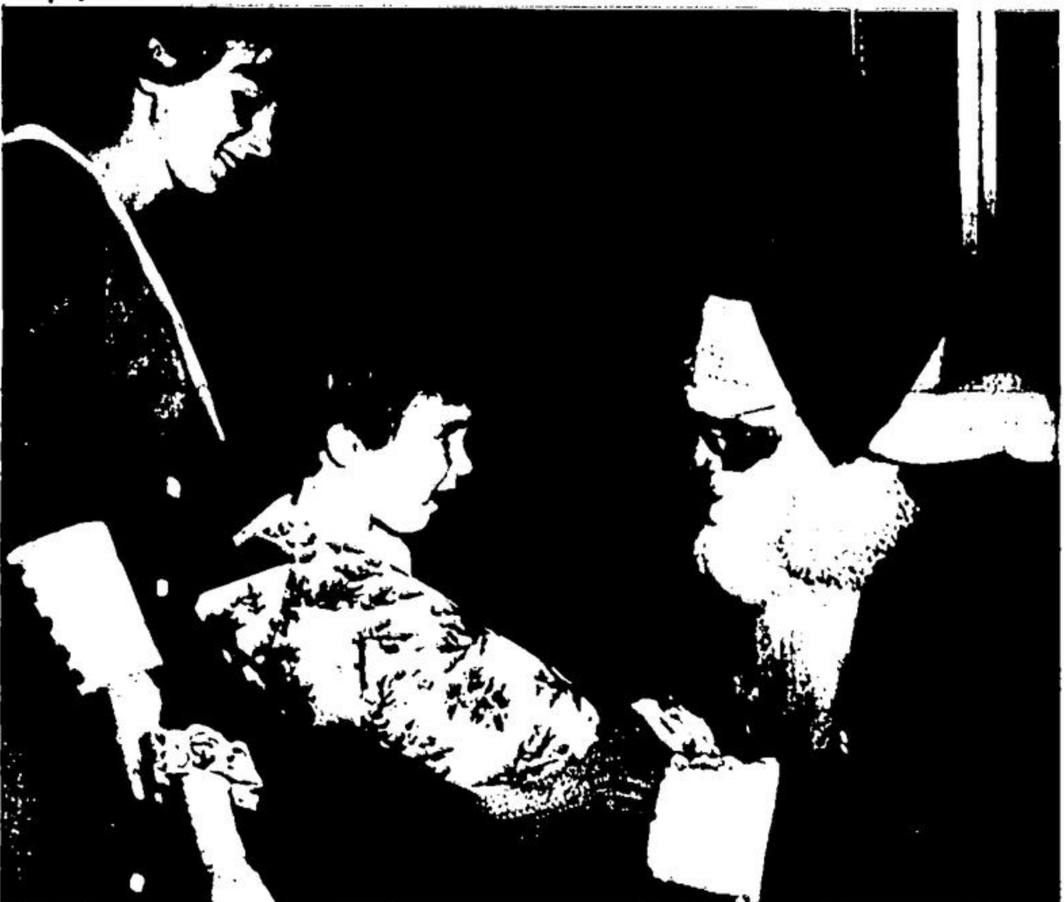
LOOKING SANTA straight in the eye, a lassie in Sunday best enjoys a little conversation before she accepts her gift.