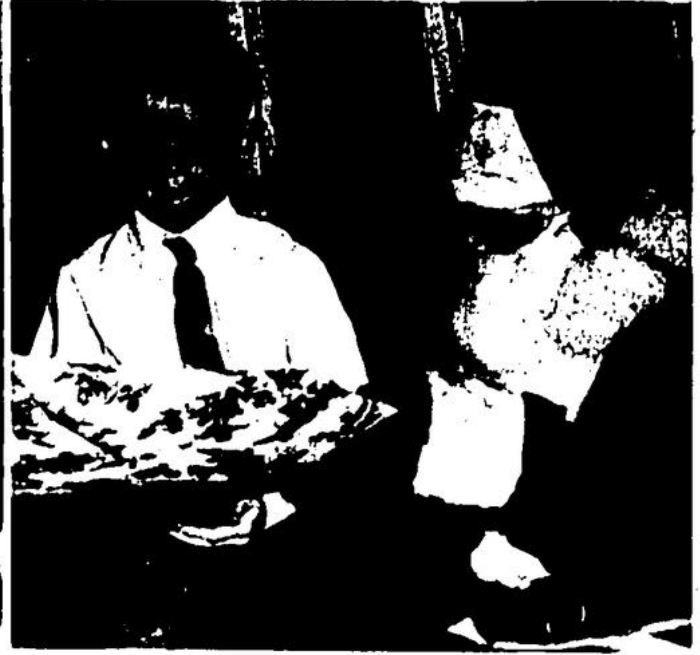
FRECKLE FACED LAD perches on Santa's knee gingerly as he eyes the odd shape of his gift.