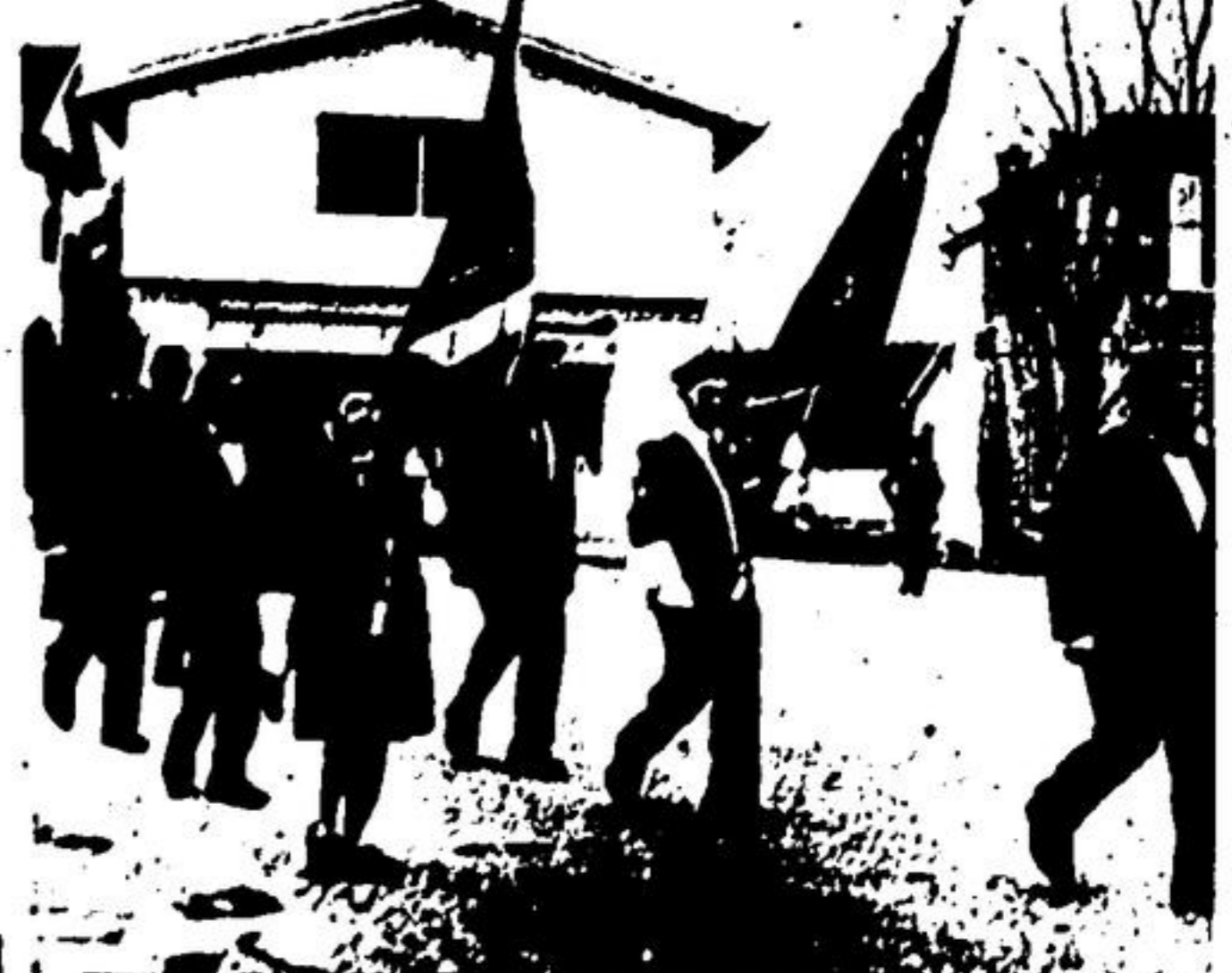
LEGIONNAIRE MAX STOREY led Sunday morning's Remembrance Day parade in Rockwood from the Cenotaph to Rockwood Centennial School, where services were held.