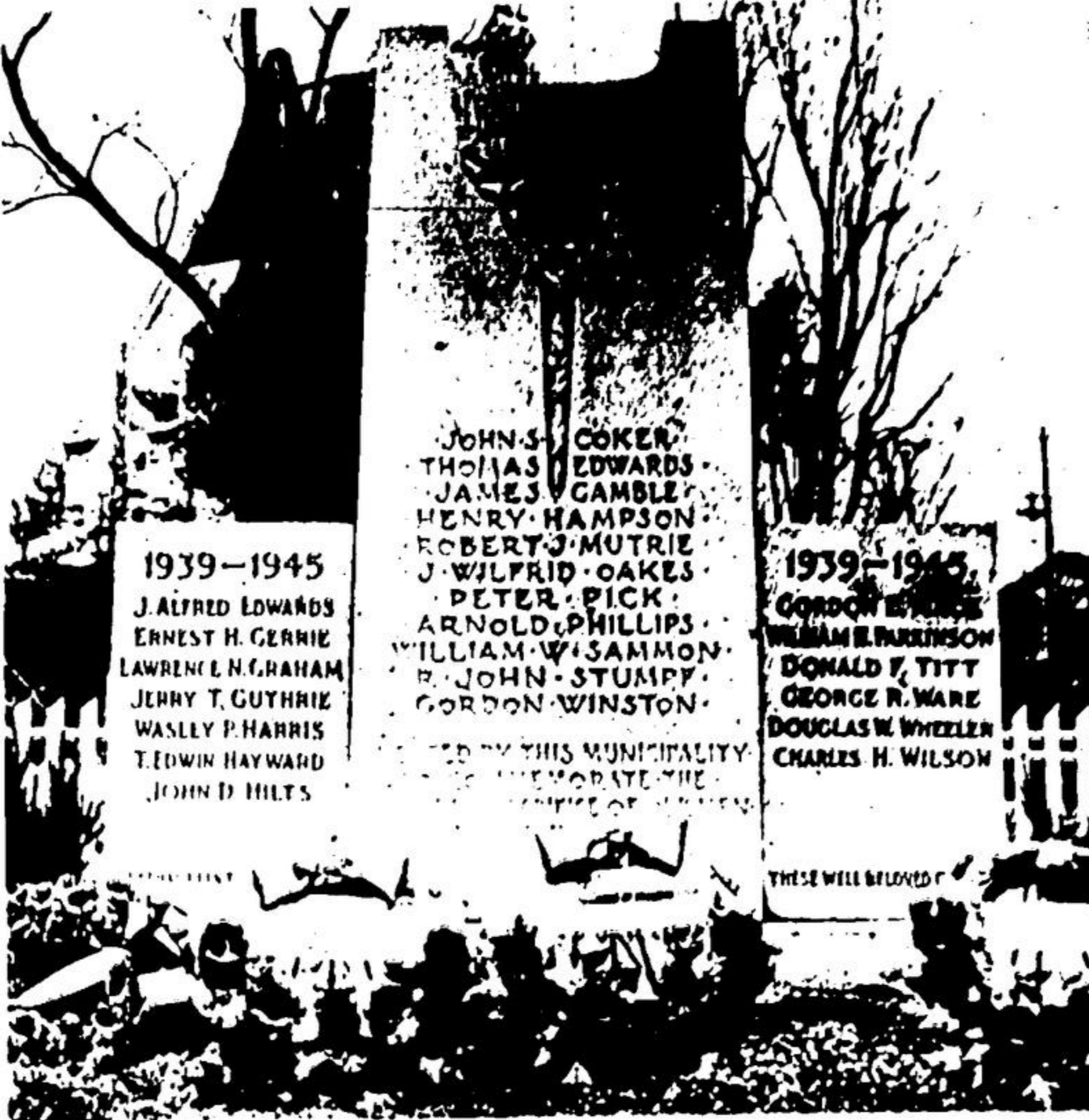
REMEMBRANCE DAY WREATHS were laid at the Rockwood Cenotaph, Sunday morning for the Province of Ontario, Royal Canadian Legion, Branch 107, Acton, Township of Eramosa and the Hills family. Later a service was held at Rockwood Centennial School.