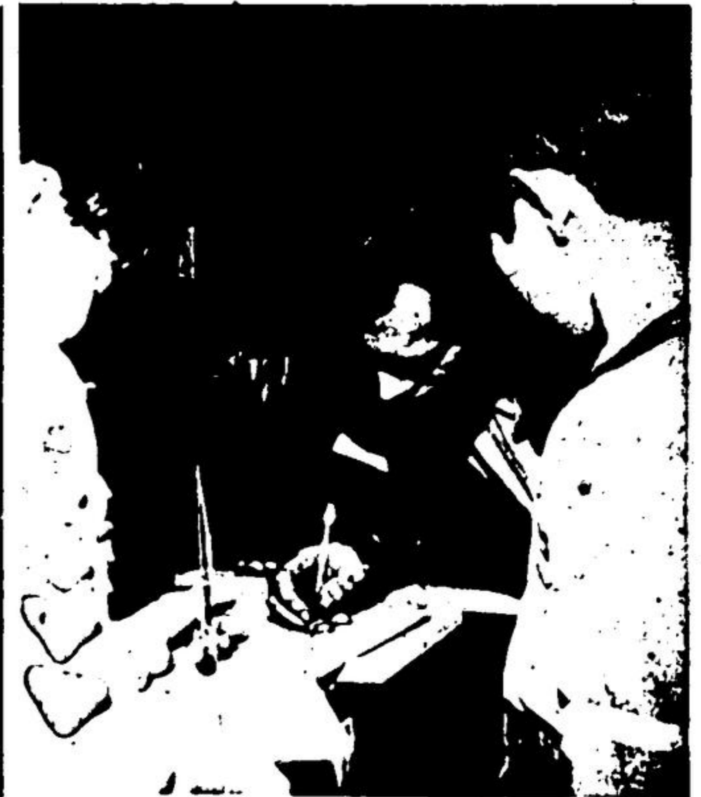
every boy to choose his own thing and discards much of traditional Scout training.