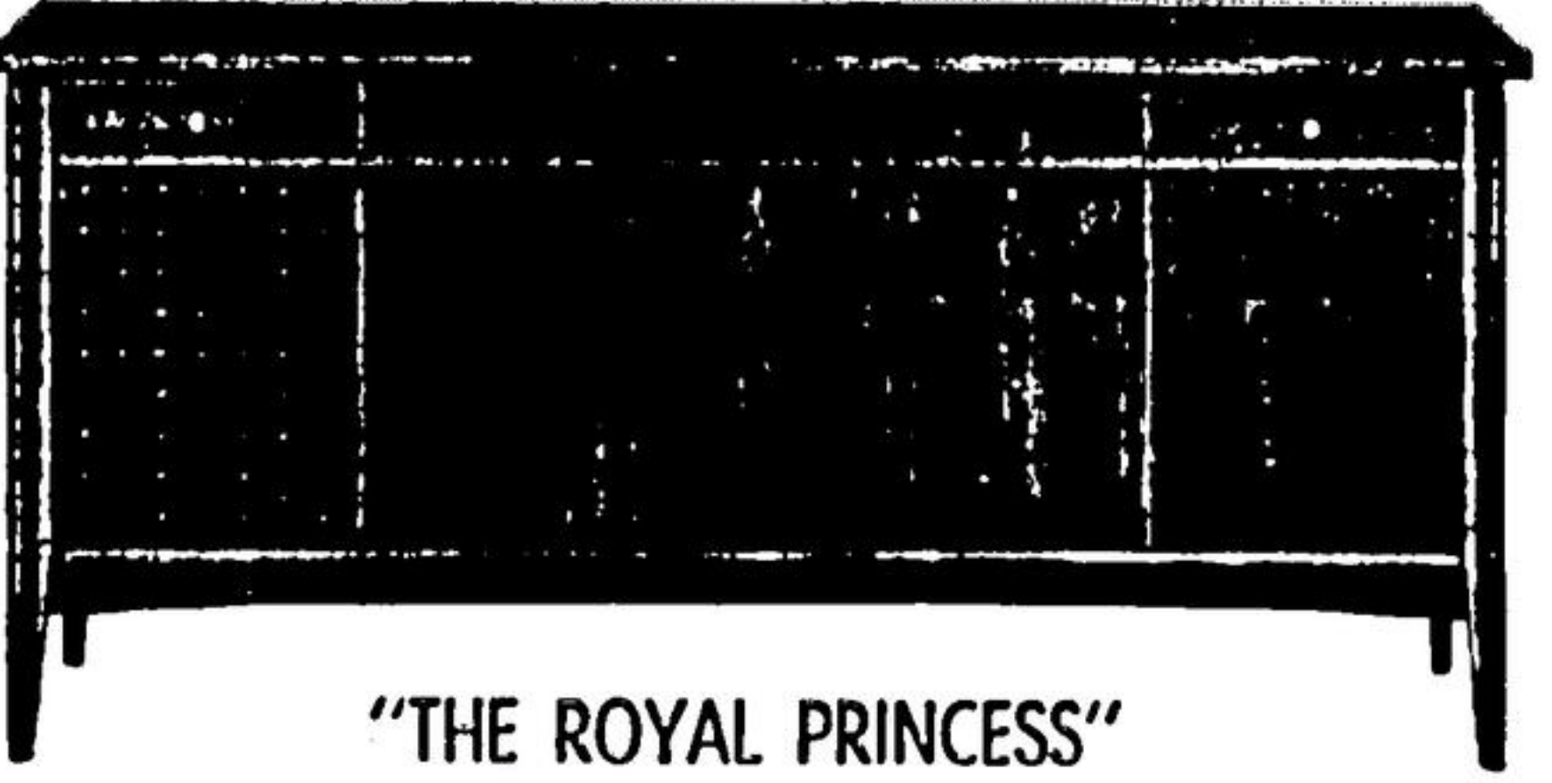
"THE ROYAL PRINCESS"

Her Majesty is designed in a distinctive contemporary buffer styled console with vertical floured panels, and finished in richly grained walnut. Some of the exciting features are: AM/FM Stereo radio with built-in Multiplex to enable you to receive FM stations. A.F.C. audio frequency control eliminates all fading while you are receiving long range FM stereo stations. The famous English Garrard 4-speed changer which allows you to use any speed record in mono or stereo, and automatically changes for the different size.