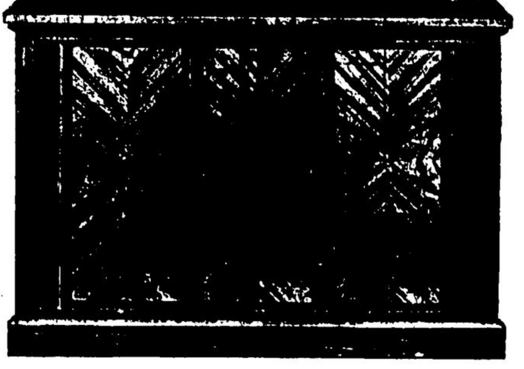
"THE FABULOUS EMPRESS"

A total home entertainment centre in a compact credenza cabinet of matching veneers. Features A.F.C., built-in AM/FM, stereo indicator light, stereo tape recorder, 4-track 2 microphones, plus 4-speed Garrard record changer. Priced at only and best, of all, made right here in Canada.