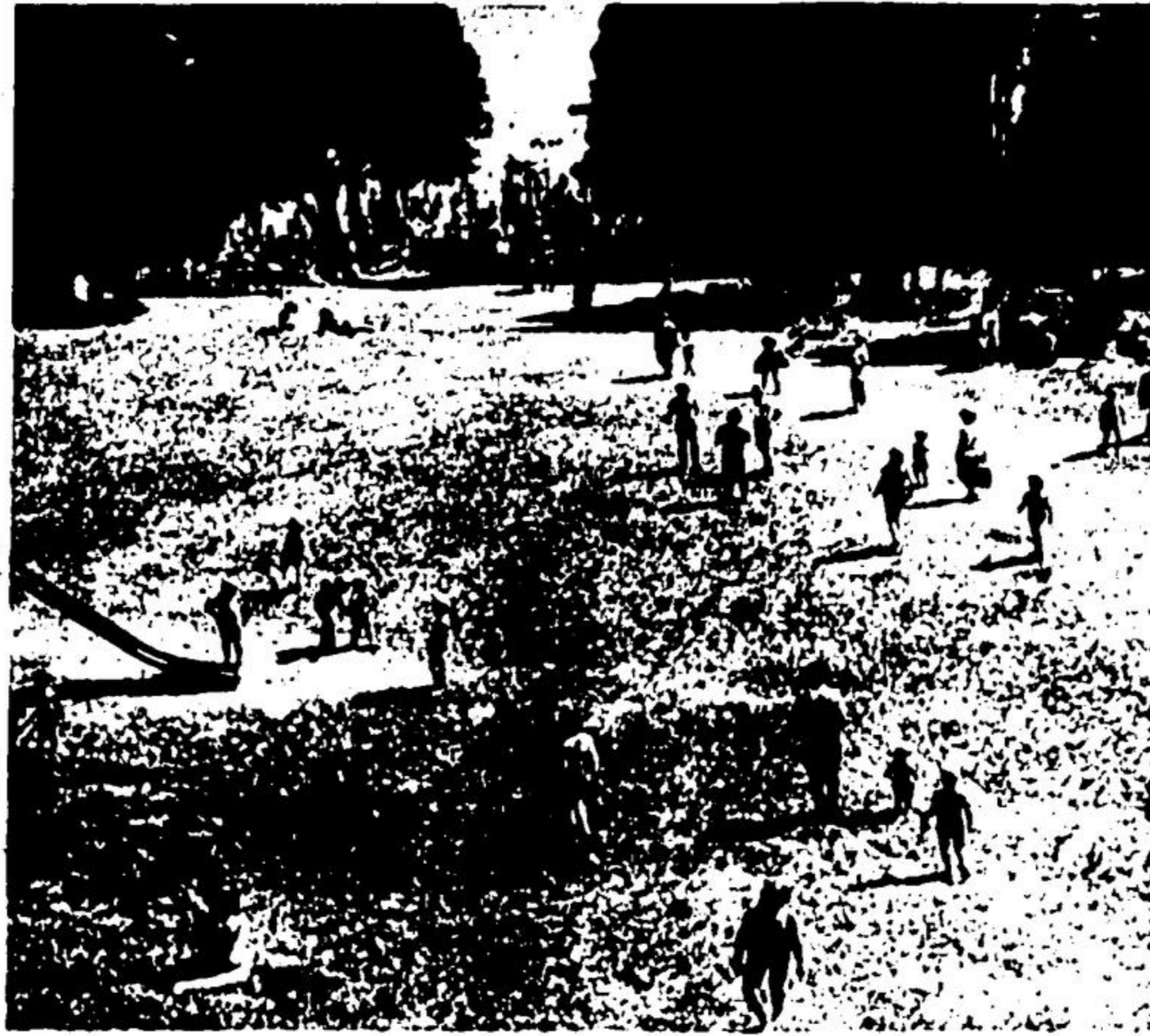
THOUSANDS JAMMED into the Rockwood Conservation Park over the weekend to enjoy delightful mid-summer weather with the temperature in the high 80's. The swimming area, top, was a busy spot while the main parking lot, below, leaves little room for expansion.