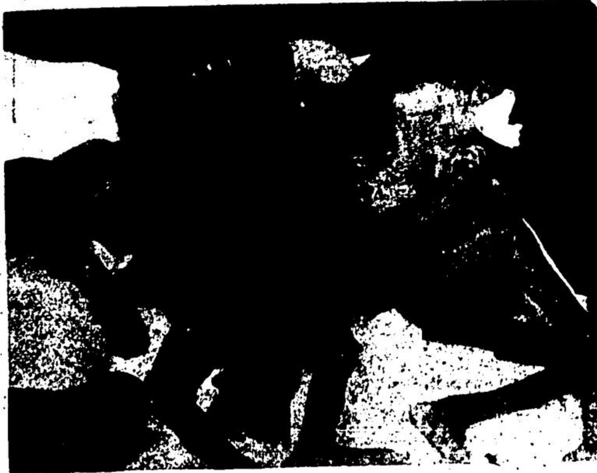
CBC TV ANNOUNCER Stanley Burke provided hundreds each day, he said, from malnutrition caused by the lack of food supplies.