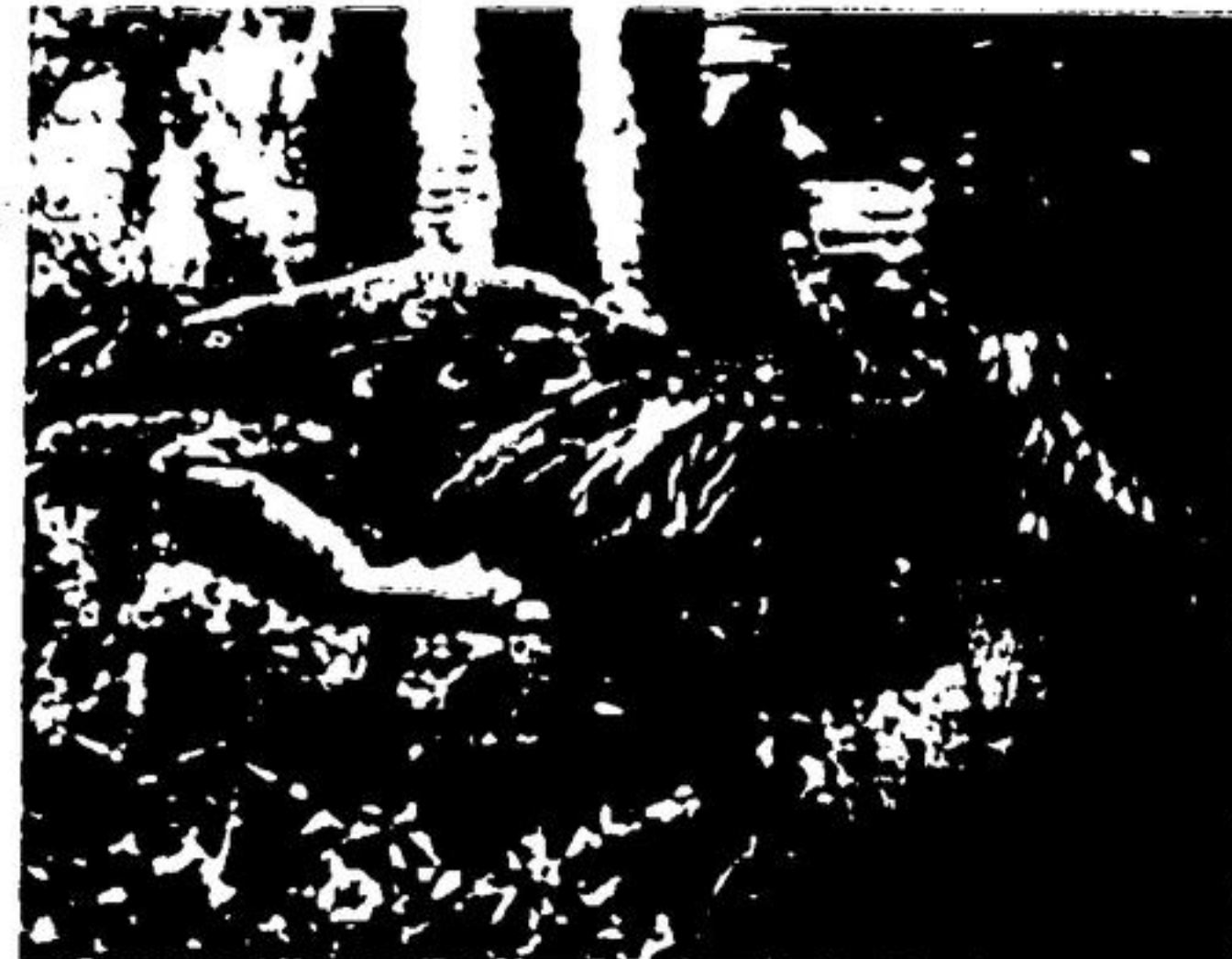
A CANADA GOOSE takes its first step into Rainbow Lake on the grounds of Beardmore and Co. after arriving from Kortright Waterfowl Park, last week.—(Staff Photo)

SCHOOL OPENS SEPT. 2 WE'RE READY... ARE YOU?