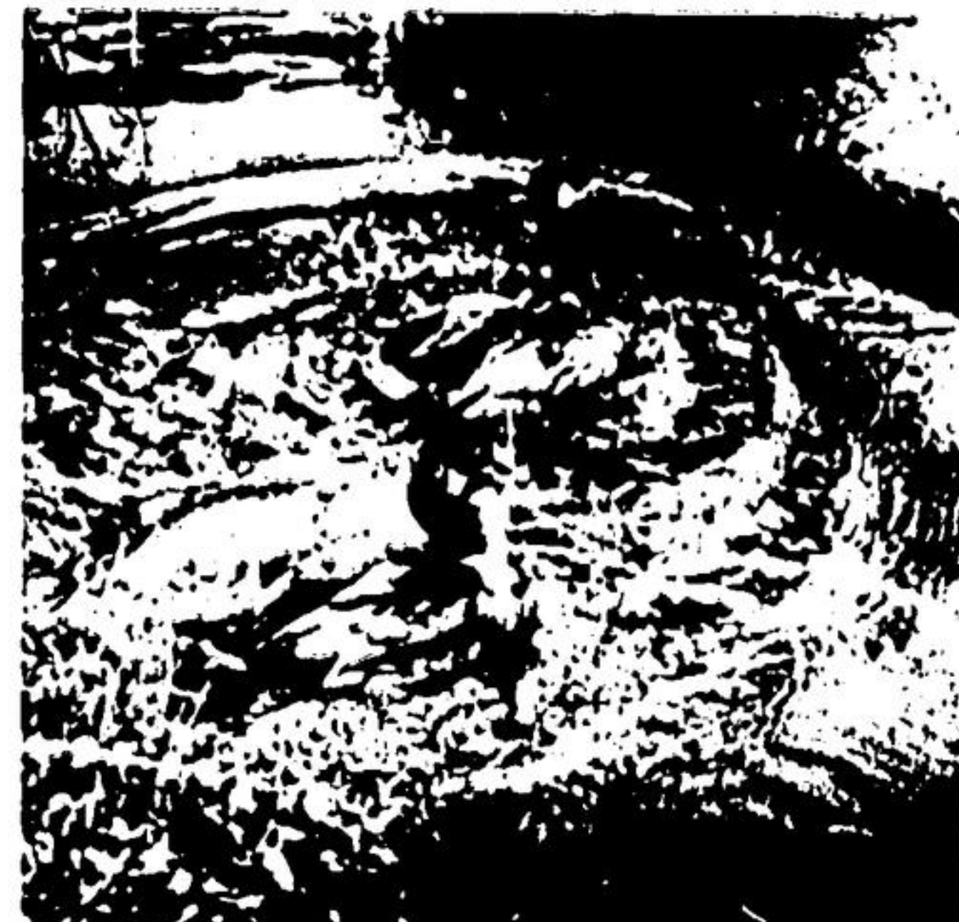
THIS PAIR OF WILD DUCKS appear to be quite contented in their new home in Rainbow Lake. The pair were one of seven brought to the Beardmore lake last Thursday.