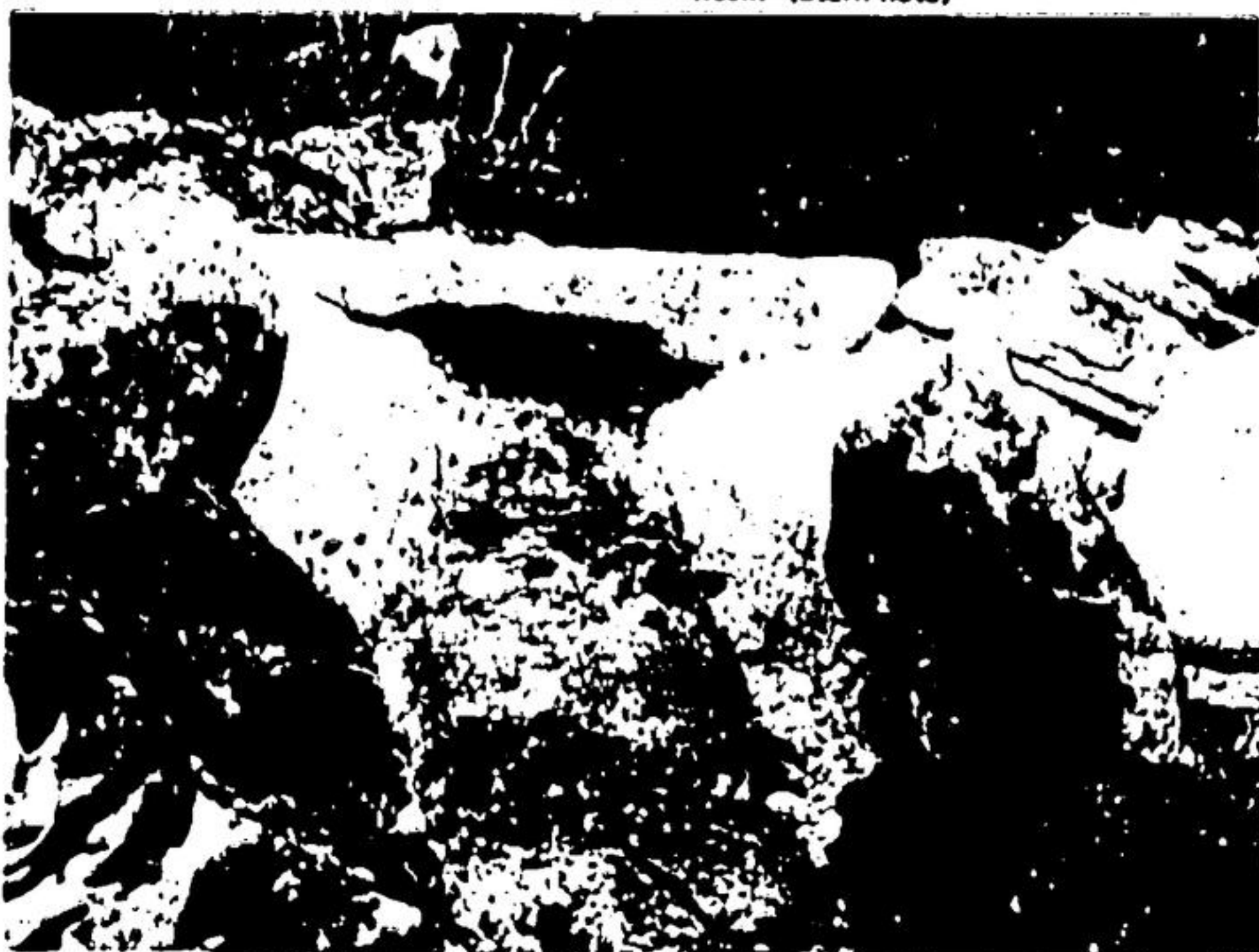
SET AGAINST A BEAUTIFUL rock garden background this waterfall jokingly named "Fiedler's Falls" after Plant groundskeeper Erwin Fiedler, is fed by water which flows by means of gravity from Fairy Lake.