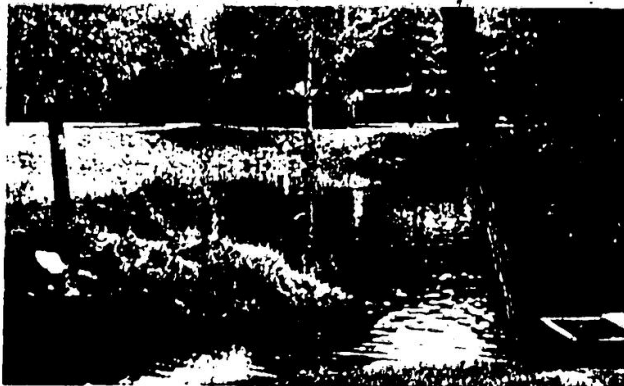
RAINBOW LAKE has been a welcome addition to the grounds of Beardmore and Co. as the Company celebrates its 125th anniversary this year. The lake has been stocked with 150 rainbow trout in addition to the assorted waterfowl that arrived from Kortright Waterfowl Park last week.

Visitors to the grounds are welcome any time during regular hours, 8 a.m. to 6 p.m. from Monday to Friday and until noon on Saturday, at which time Pinkerton guards are on hand to admit them. Picnic tables and benches are provided for their convenience.