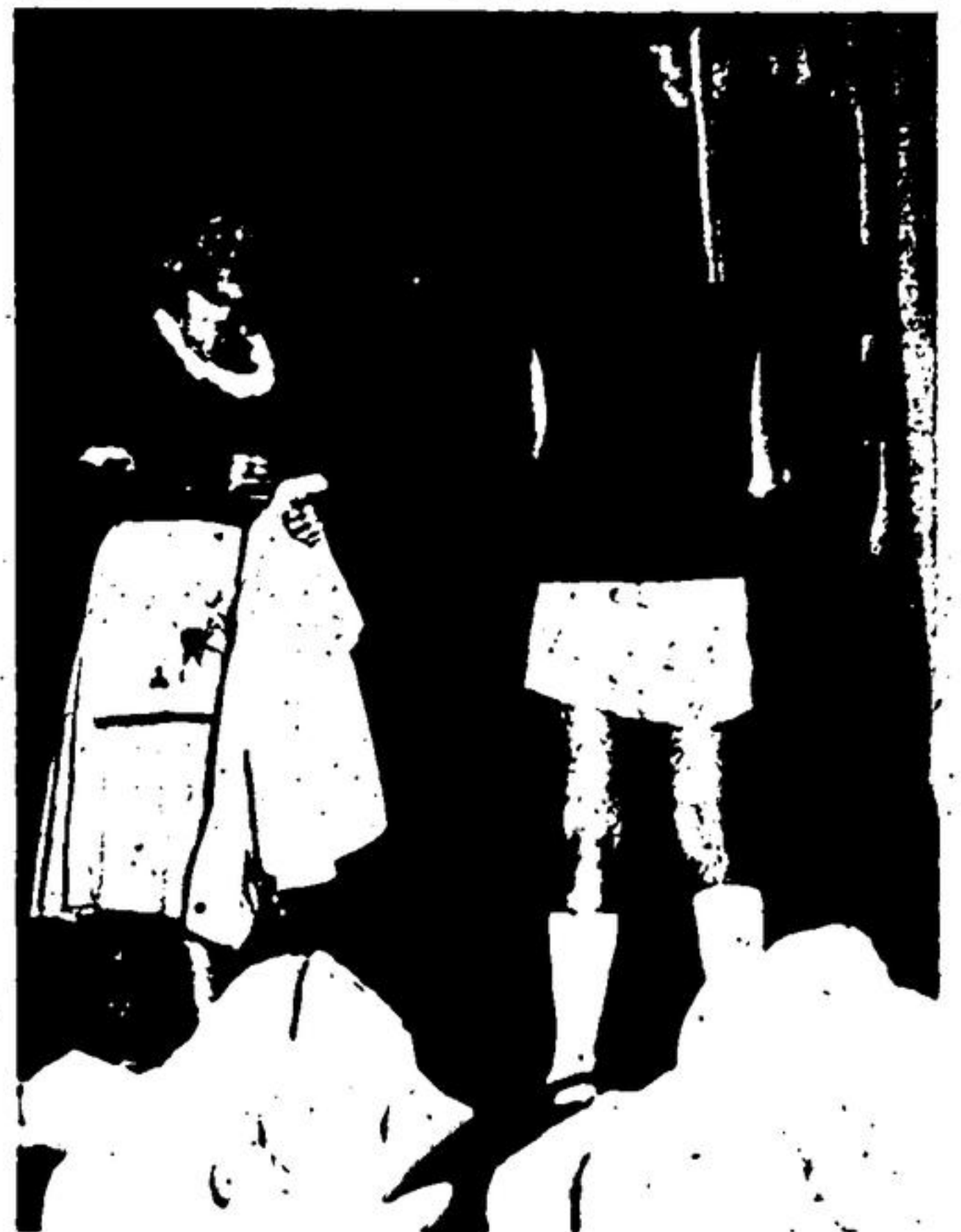
CINDERELLA HAS HER TROUBLES with her stepmother but not nearly as disastrous as the prop men who kept the fireplace from collapsing at this dramatic moment in the Playground program at the high school.—(Staff Photo)

a head added another $19 to the pot. Activities this year earned the children $100 which was used for treats and trips.