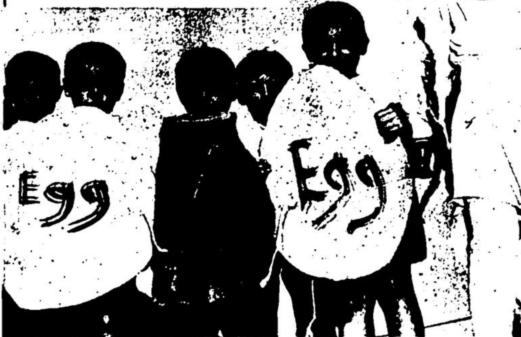
EGGS MAY GO UP in price but these children aren't part of a price protest. They are part of the cast of Jack and the Beanstalk, part of the Playground concert last Wednesday. The goose that laid the golden egg is on the right.