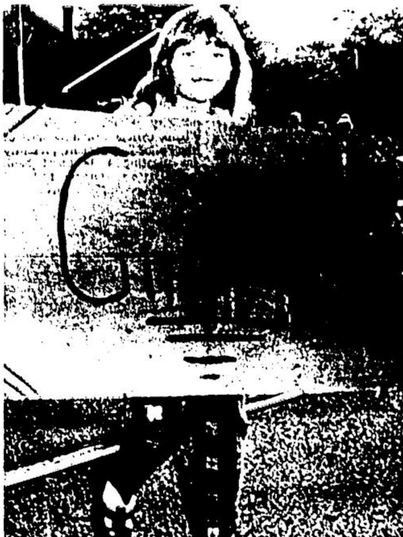
PLACARD CARRIERS in the play ground parade last Wednesday identified the fairy tale characters for hundreds of spectators who applauded the floats and fairy tale characters.