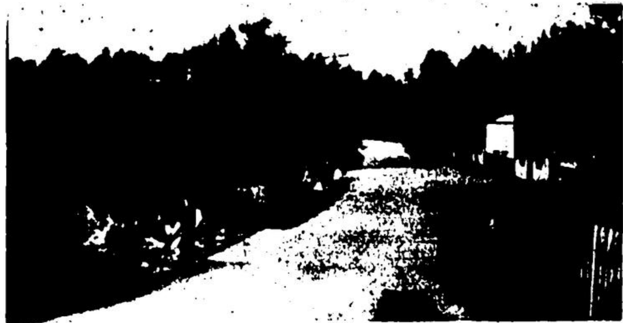
OLD VALLEY ROAD in Rockwood used to have trim homes along its side, but these have all been torn down. Boys in bloomers and girls in long skirts play at the side of the river.